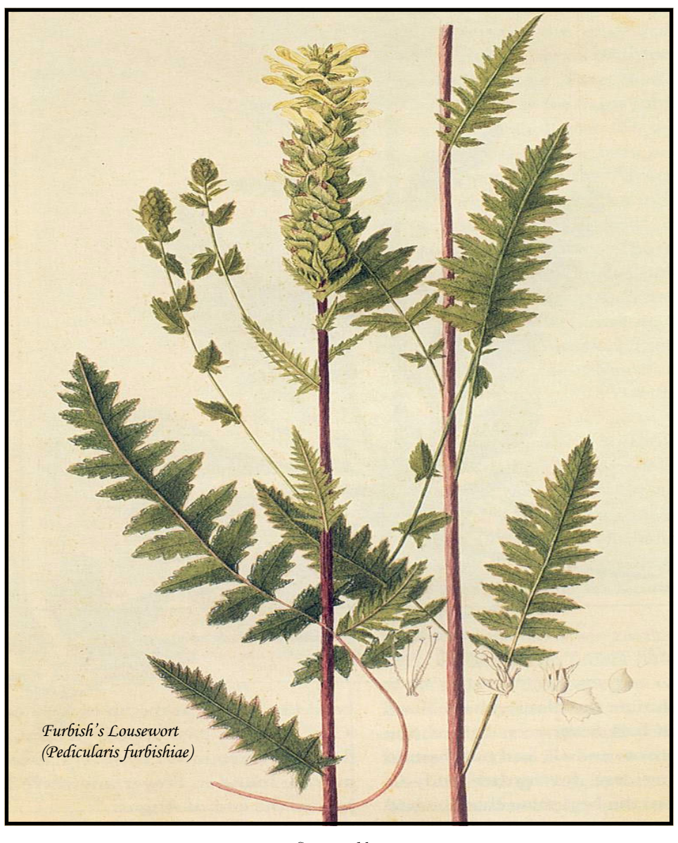
{\bf Sponsored\ by} Maine Natural Areas Program and the U.S. Fish and Wildlife Service