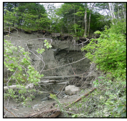
Riverbank erosion along the St. John River after heavy rains in

Forested buffers provide essential shade to lousewort plants and help prevent erosion of the river bank. A forested buffer is a band of trees and shrubs at the upper edge of the riverbank. The root systems of trees and shrubs hold soil in place and absorb water and nutrients. A canopy of trees and shrubs intercepts raindrops and reduces their impact on soil erosion. Low herbaceous plants and a layer of forest duff help filter sediment and pollutants from runoff. Forested buffer plays a criti-