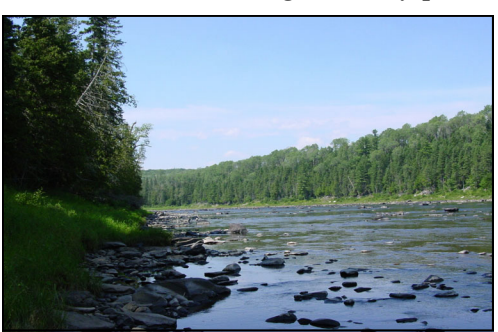
Intact forest buffer along the St. John River

Planting or maintaining a forested buffer at least 75 feet deep and consisting of native trees is perhaps the single most important action that a landowner can take to help protect the integrity of the St. John River. Stabilizing banks by planting bare-root tree seedlings in