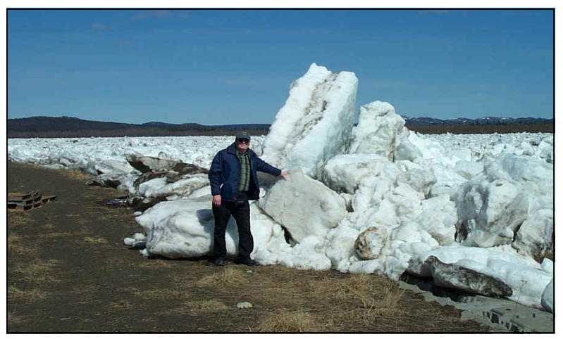
Ice flows play a significant role in the dynamics of the St. John River

The St. John River is one of a very few places in the U.S. where the natural cycle of spring flooding occurs as it has for centuries. There are no impediments to river flow from the headwaters of the St. John all the way to the dam at Grand Falls, New Brunswick, 200 miles away. The headwaters tend to thaw before more northern sections of the river, creating ice flows and spring floods that scour the river banks and keep them free of trees and tall shrubs.