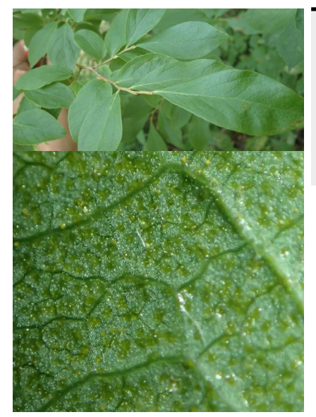
Huckleberry ( Gaylusaccia sp. ) can be distinguished from other members of the blueberry family by resin glands on the underside of the leaves.