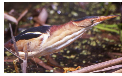
Maine is the northern edge of the least bittern's breeding range.