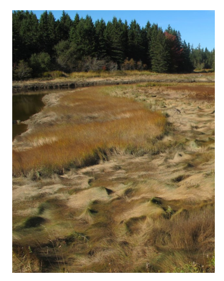
Typical saltmarsh vegetation, with smooth cordgrass (Spartina alterniflora) low marsh adjacent to the river channel and matted saltmarsh hay (Spartina patens) high marsh in more elevated areas.