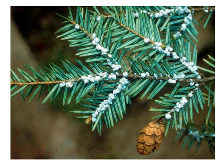
Hemlock wooly adelgid infested branch.

While it is unlikely that we humans can eat our way out of our knotweed problem, research is currently being done to determine if the psyllid Aphalara itadori an insect species endemic to Japan specializing on Japanese knotweed— can be safely released in the United States.