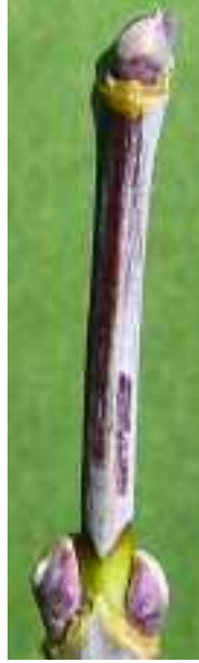
Boxelder twigs are purple and covered with a whitish waxy bloom.

The bark is light gray and smooth on young stems, becoming roughened and shallow-fissured on older trees.