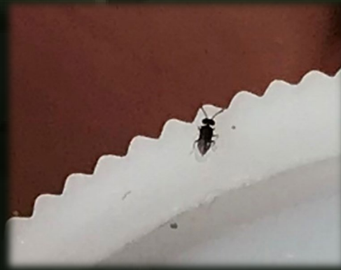
Oobius agrili parasitizes EAB eggs on ash bark