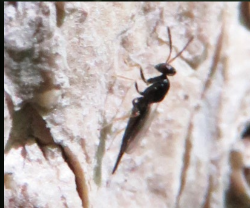
Tetrastichus planipennis parasitizes EAB larvae under ash bark