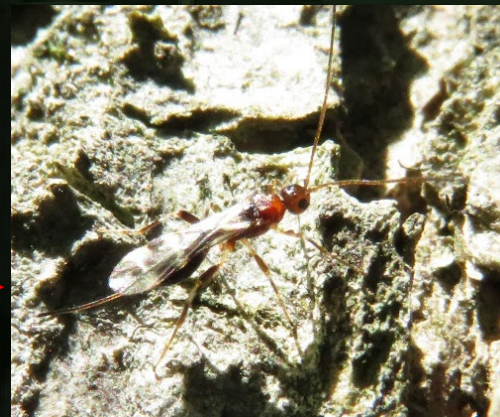
Spathius galinae parasitizes EAB larvae under ash bark

These parasites will not save the trees standing now, but they should help the next generation of ash to survive.