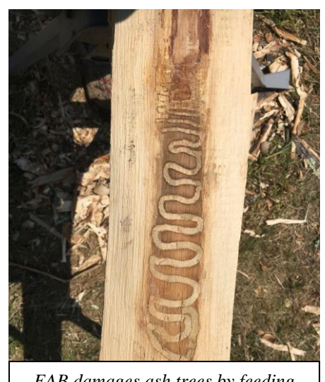
EAB damages ash trees by feeding on the inner bark

Yes, EAB was first discovered in Frenchville, Grand Isle, Madawaska, Acton, and Lebanon, Maine in 2018 and is expected to establish in other parts of Maine. For the up-to-date list of towns impacted by EAB please refer to the map located at <a href="www.maine.gov/eab">www.maine.gov/eab</a>. With over 100 million native ash trees located throughout Maine, EAB will have significant economic and ecological impacts.