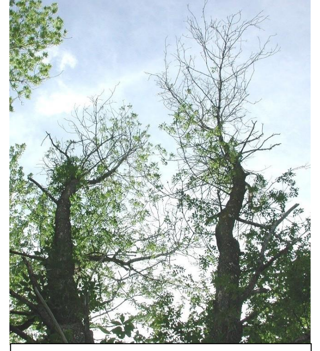
EAB-infested ash trees often die in 3-5 years.