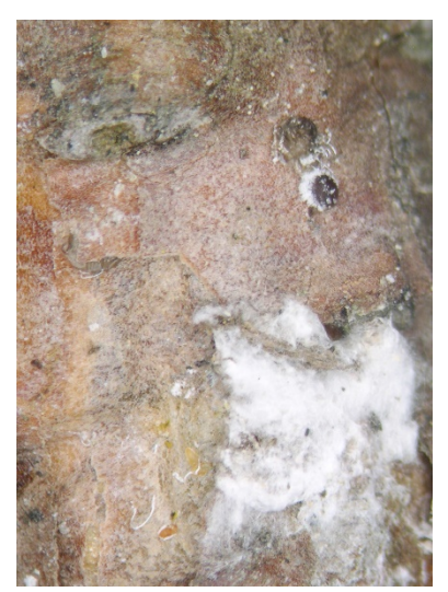
Image: Signs of red pine scale including resting stage (top) and flocculence (bottom).

Aerial survey this summer picked up an area of about seven acres of declining red pine in Berwick. A site visit to determine cause of the damage revealed declining trees with brick red foliage and lower-crown branch mortality. Upon closer observation of samples in the lab, the trees were found to have Diplodia tip blight, a chronic fungal blight that often leads to long-term decline in red pines in Maine, and infestation by red pine scale. White, cotton-like fuzz (flocculence), a sign of red pine scale, was observed. Other insects, including adelgids, produce similar flocculence. However, characteristic coverings of the cyst-like resting stage of the scale were also observed. Red pine scale is an invasive bast scale of hard pines including red pine (other hard pines native to Maine are not impacted by this species). This is the second detection of red pine scale in York County. The scale is likely more widespread since infestations often go un-noticed until the trees are in severe decline. Winter harvests of infested trees can help to limit both spread of red pine scale and long-lasting impacts from Heterobasidion root disease at the site. Material