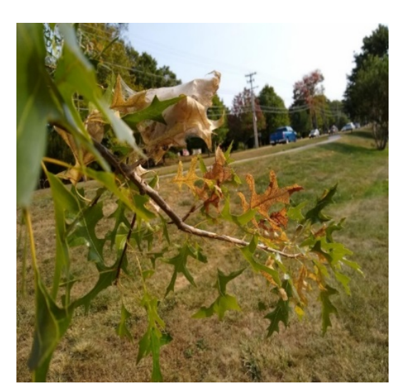
Image: Scale of skeletonization damage that can occur on a branch in relation to the winter web.

The browntail moth (BTM) caterpillars that hatched from their egg masses in August have been feeding and growing for about a month and a half. These young caterpillars do not have the irritating hairs for which older (4th instar or above) BTM caterpillars are infamous. While feeding, caterpillars graze on the outer layer of the leaf, a type of defoliation called skeletonization. This feeding causes leaves to die and turn a coppery color which is very apparent this time of year, especially in areas with high concentrations of BTM caterpillars. MFS staff uses this type of damage to detect higher populations of BTM from the air during our late-summer aerial surveys. This September aerial survey detected intensified defoliation around the Androscoggin River corridor from Auburn to North Turner, primarily on the western side of the river; surrounding Lake Cobbosseecontee; and around China Lake, Webber Pond and Three Mile Pond. It also confirmed