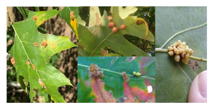
Image: A small sampling of the types of galls on found on oak leaves.

Every year, we get calls and emails about strange growths seen on oak leaves. These growths come in many, many different shapes, sizes, and colors. Sometimes they are on the upper surface of the leaves, sometimes on the lower. Some are fuzzy or spiky, and some are smooth. Sometimes they are on the petioles ('stems') of the leaf. These are galls, and oaks have an amazing abundance and variety of them. Some galls are formed by miniscule nonstinging wasps, and some by tiny mites. Although