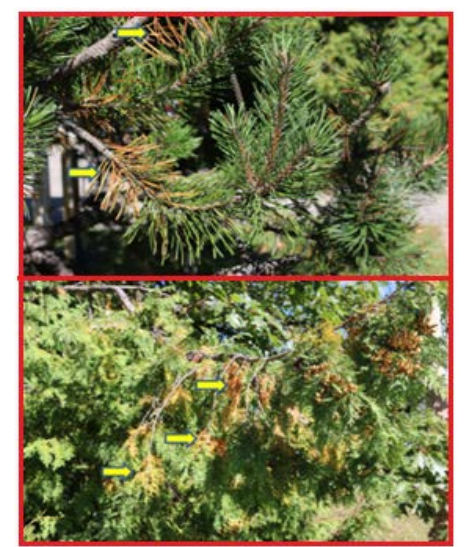
Image: (top) Orange inner foliage typical prior to seasonal needle drop by mugo pine; (bottom) white cedar.

In the coming weeks, people may notice coniferous tree species shedding needles. The needles on twigs and branches closest to the interior of the tree, which are the oldest needles, begin to turn a pale-yellow to orange color before dropping onto the ground, lawns, cars and driveways. Unless there are clear signs of injury, wilting, signs of insect feeding or signs of fungal infection (e.g., black spots or banding on needles), there is no cause for alarm. This is very likely simply due to the natural phenomenon of seasonal needle drop and not an insect or disease problem. Although conifer needle disease incidence and severity has been high during the past few years, the premature needle drop caused by those disease agents typically happens in June and July.