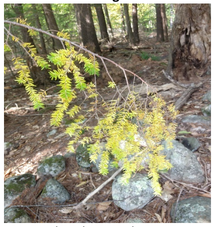
Image: Hemlocks throughout Maine have been exhibiting yellowing of older, interior needles.

Hemlocks throughout Maine have been exhibiting yellowing of older, interior needles. The Maine Forest Service forest pathologist has inspected many of the trees showing this symptom and has not seen any sign of insect or disease. Thus, the thought is that this yellowing, expressed over a large area, is a response to the droughty conditions experienced over much of Maine this growing season. Hemlocks in the landscape setting showing this symptom should be regularly watered into the fall to prevent winter injury. Hemlocks in forested areas should be fine, but may become predisposed to