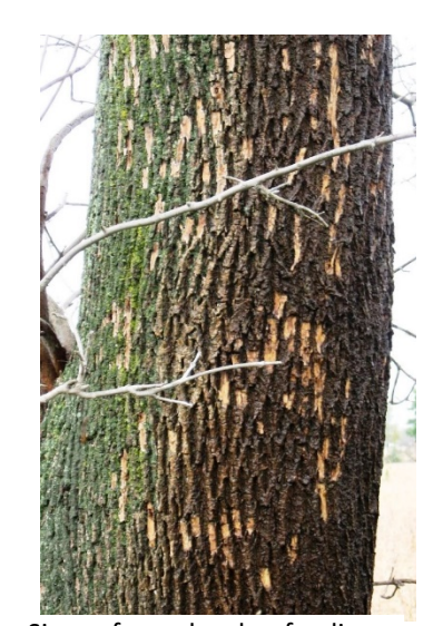
Signs of woodpecker feeding on ash indicates possible EAB.

We encourage subscribers interested in getting all the Department announcements about emerald ash borer (EAB) to sign up for the topic "Emerald Ash Borer (EAB)" on the department's e-mail/SMS subscription service: https://public.govdelivery.com/accounts/MEDACF/subscriber/new.