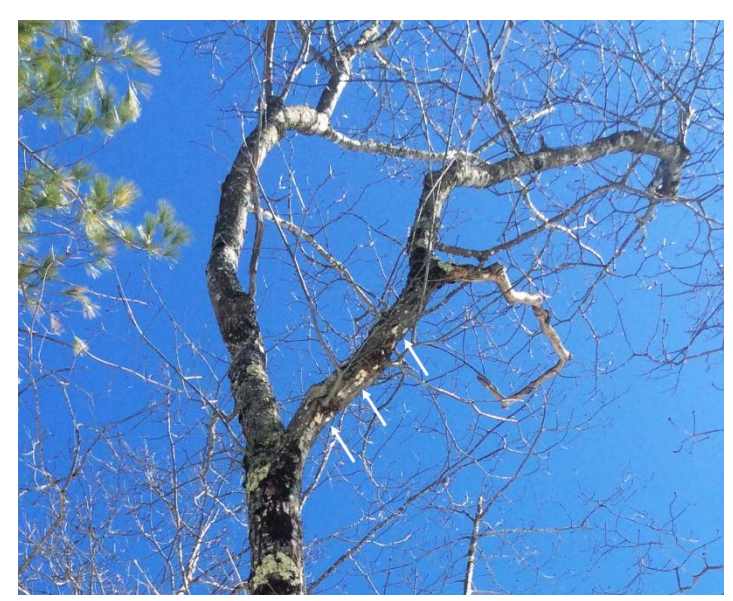
The upper crown of an oak tree in Woolwich, Me. Arrows indicate locations with multiple gypsy moth egg masses.

Ground-Nesting Bees – Although the weather is still a bit wintery at times, we will soon see solitary ground-dwelling bees emerge and become active. When they first emerge in early spring, they are usually very active, with much flying around, mating, exploration and nest-building. As people increase their yard-work activities, they begin to notice the bees. All this activity by bees can look frightening. However, solitary bees (one nest for each female, although you may have many nests in one area) are generally non-aggressive and will not sting unless severely harassed. The males can often act very aggressive while they fly around searching for a mate, but they can't sting at all. This heightened activity persists for only a week or two, and then the bees are almost unnoticeable. Ground nesting bees are valuable pollinators.