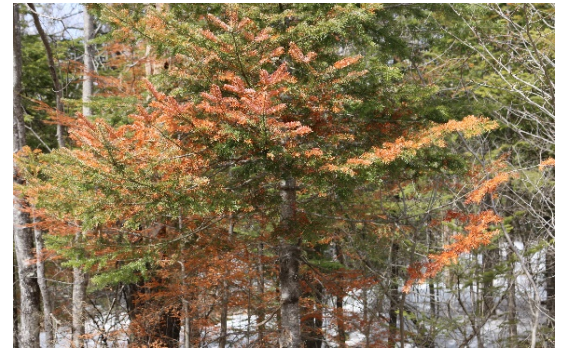
Orange foliage typical of roadside trees (here, balsam fir and hemlock) in late winter suffering from winter burn and/or road salt.

Winter burn results when the aboveground portions of evergreens are exposed to warming air temperatures. This stimulates photosynthesis, involving the opening of pores in the foliage (stomata) for gas exchange. If the ground remains frozen and the lost water is not replaceable by the roots there is not enough moisture to sustain the needles and fine branches, causing these tissues to die. Once desiccation occurs, the plant tissues are irreversibly damaged and will not recover. While all evergreens are more-or-less equally susceptible to winter burn, a tree's location is the most significant