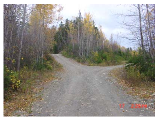
RE6b (to right)