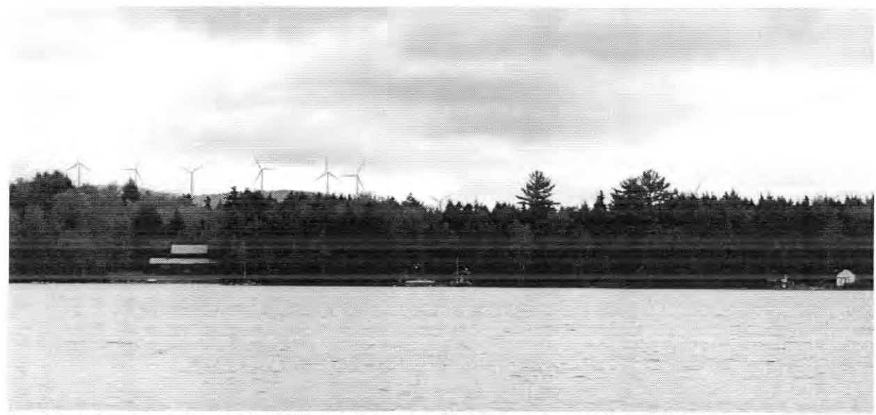
"A picture is worth a thousand words." This is what Bottle Lake will really see. Those distant panoramas with tiny turbines presented in Exhibit 17 do not convey the full visual impact. Other lakes see more turbines than this and closer up. From LandWorks Arc GIS/Adobe Photoshop # 6.

The following is a three –page <u>summary</u> of four reasons why this permit should be denied. The rest of the material is an expansion on those points and other detailed comments on the Application.