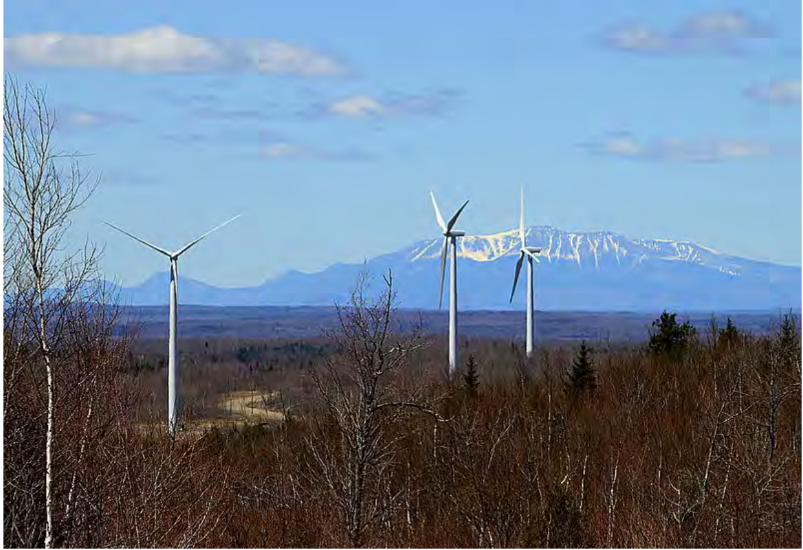
This photo was taken from the ground of turbines on the north end of Rollins Mt.

These are the first two images for release. I hope it inspires you to make one last push to write to or telephone the EUT committee members before their work session on Thursday. And send these photos to every person you know who has ever taken a hike to enjoy our beautiful state or vacationed here. Again, I weep tears of sadness and anger when I work with these images. This madness of destroying Maine's natural heritage must stop!