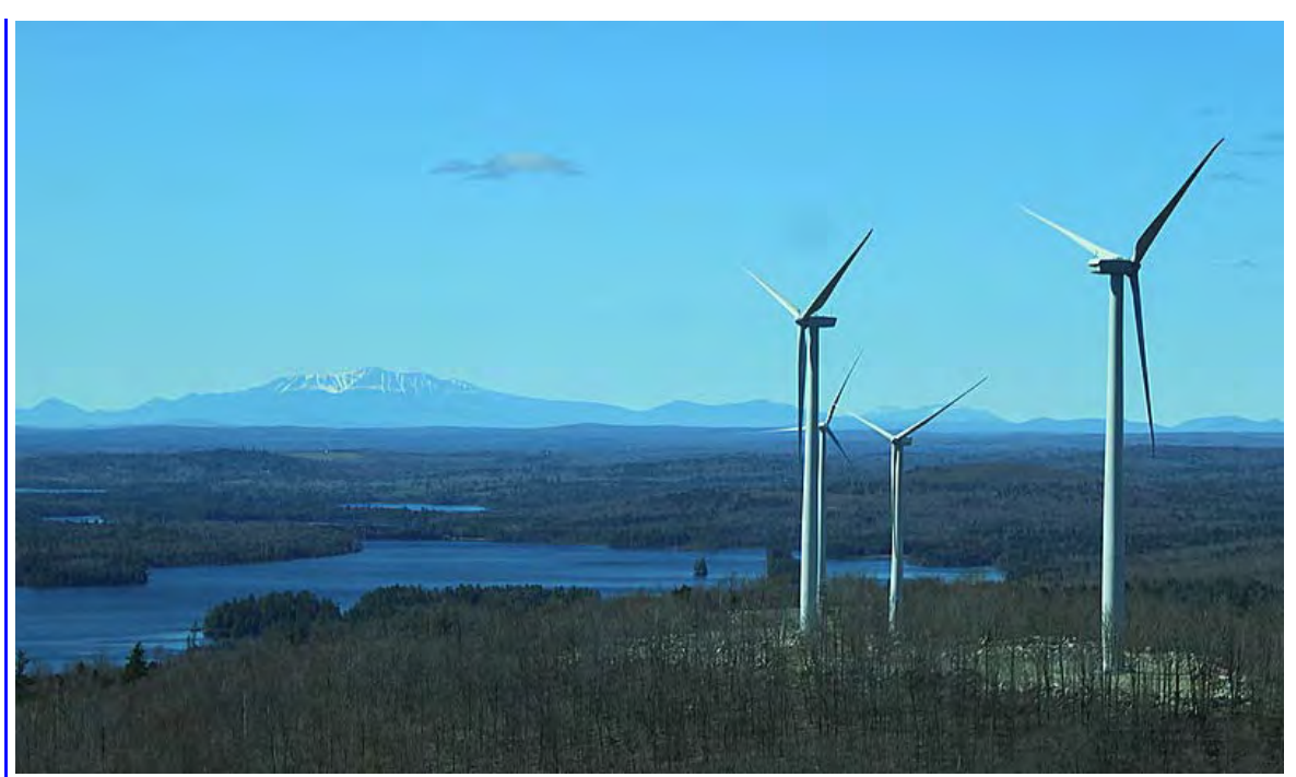
This photo taken from the air shows turbines on a Rocky Dundee ridge in the southern end of the sprawling project. The lake is Upper Pond, home to a nesting pair of eagles right below this ridge.