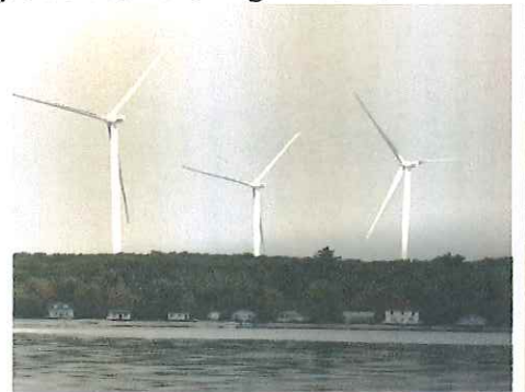
behind camps-23 turbines (sample) across the lake-7 turbines (just a sample)

This is the simulation behind our camps and across the lake at Schoodic. Remember these are 656' high and as close as .8 of a mile from us. Why would anyone have a right to force this on us? At least let us vote on it!