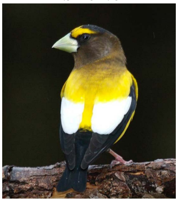
A male Evening Grosbeak showing their stunning white secondaries and massive seed-crushing bill.

There is a figurative eruption of finches heading our way this winter but a literal irruption of finches coming south. Not all irruptive species are migratory in the traditional sense of the word. A typical migratory species makes an