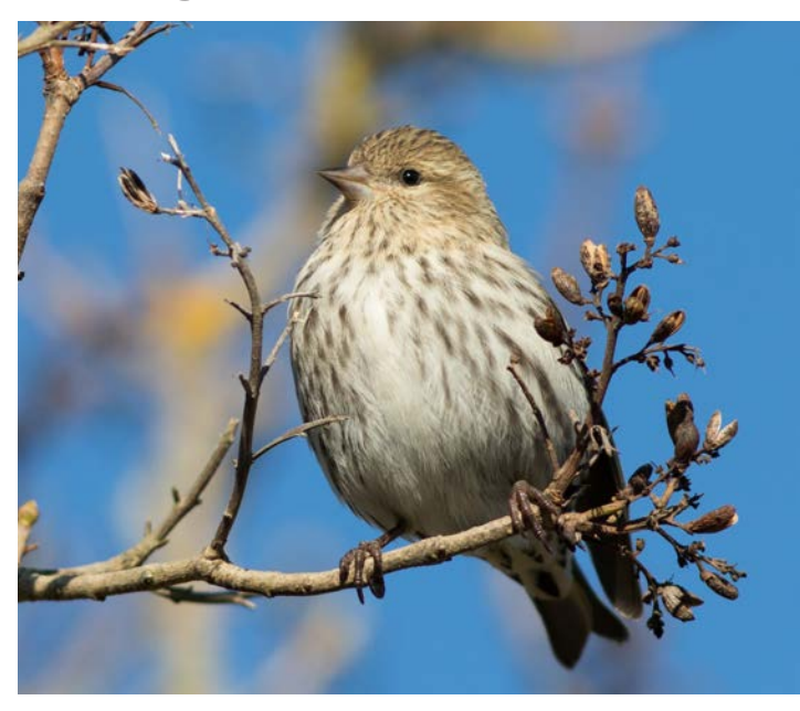
Pine Siskin have small and very pointed bills, similar to gold-finches, which are ideal for eating smaller seeds. Try adding thistle seeds at your feeding station this winter to attract these birds!

annual movement from Point A to Point B and irruptions occur when a species has to go to Point C because of a lack of resources (generally food). In subsequent years, that species will return to the A-B-A-B pattern, or remain sedentary (in the case of non-traditional migrant species.) Snowy Owls are another irruptive species that are tied to the cyclical population booms of lemming and voles which occurs roughly every four years.