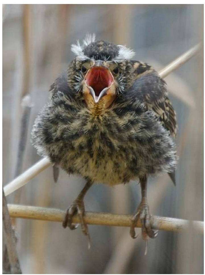
This Red-winged Blackbird has fledged but was still dependent on adults for feeding. Combining visual hints with behavioral cues will help avoid reporting errors.