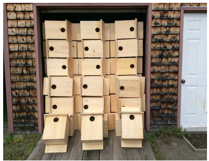
Just a few of the screech-owl boxes made by our woodworking volunteer Ralph Thurston!

By putting up boxes we can supplement that available nesting sites and easily monitor these birds. More information on joining one of these nest box monitoring programs will soon be on the atlas blog: maine.gov/wordpress/ifwbirdatlas/