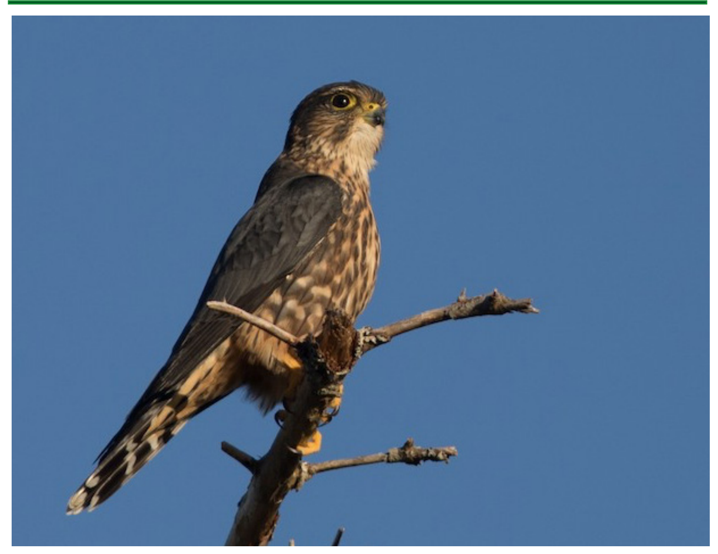
Merlin, Maine's medium-sized falcon, are an recent nester in Maine (see page 1 for details). Their nesting has increased across the state over the past decade and making sure we plot their locations correctly is especially important. Raptors can have a large area they are foraging in so use caution when plotting the various behaviors you see. With extra effort, you may even find their nests, often an old crow nest, usually in an evergreen. Listen for noisey nestlings to pinpoint their location.