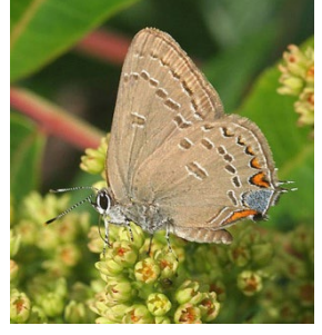
Edwards' Hairstreak

mainly in the towns of Kennebunk, Wells, Waterboro, Shapleigh, Hollis, and Fryeburg. These unique habitats are especially rich in rare Lepidoptera (butterflies and moths), hosting species that feed on the specialized barrens vegetation, such as Edwards' Hairstreak (Endangered), Sleepy Duskywing (Threatened), Cobweb Skipper (Special Concern) and Barrens Buck Moth (Special Concern). Other rare species associated with Maine's barrens include the Black Racer (Endangered), Grasshopper Sparrow (Endangered), Upland Sandpiper (Threatened), Short-eared Owl (Threatened), and Northern Blazing Star (a Threatened plant). MDIFW is committed to working cooperatively with