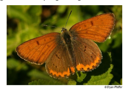
Bronze Copper

Copper butterflies (Special Concern), Northern Leopard Frogs (Special Concern) and Ribbon Snakes (Special Concern) are also found in sedge meadows. Other rare species associated with this unique Maine habitat include the Sedge Wren (Endangered), Least Bittern (Endangered), and Northern Harrier (Special Concern). MDIFW is committed to working cooperatively with landowners, land trusts, and towns to conserve Maine's best examples of riparian sedge meadow and the unique biota found there.