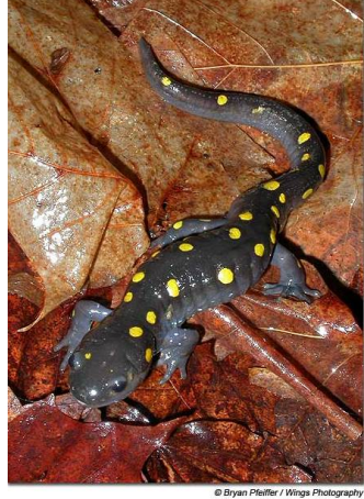
Spotted Salamander

pool habitats during their life cycles, as do many more familiar species such as black and wood ducks, great blue herons, broad-winged hawks, deer, moose, fox, mink, bats and other small mammals. Some forest herbivores are drawn to vernal pools because they serve as spring oases where the season's first herbaceous forage is available. Forest predators are attracted to vernal pools because of the abundance of amphibian prey occupying the surrounding forest floor. The collective weight (or "biomass") of these unseen spring amphibian sentinels has been estimated to exceed that of all birds and mammals combined in some forests! Indeed, their sheer abundance and palatability has many biologists and sportsmen convinced that the terrestrial wanderings of pool-breeding frogs and salamanders play a powerful role in the local ecology of Maine's woodlands.