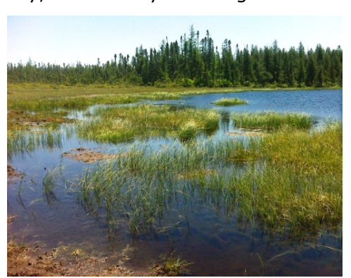
Riparian Sedge Meadow

Maine's riparian sedge meadows are seasonally flooded wetlands that occur along the borders of free-flowing rivers and streams. They are a dynamic habitat, characterized by a short period of flooding from snow and ice melt during April and May, followed by receding water from the floodplain during summer months. This