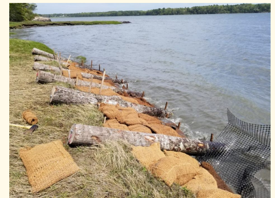
"Living shoreline" restoration project, Brunswick, Cumberland County, Maine.