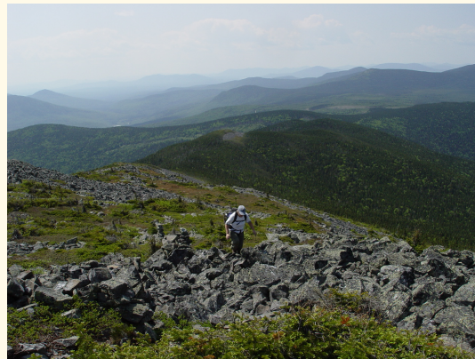
Mt. Abraham, Franklin County, Maine.

BRILUP Programs empower individuals to build strong, resilient communities and safeguard Maine's natural features.