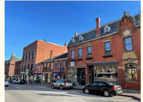
Downtown Belfast, Waldo County, Maine.