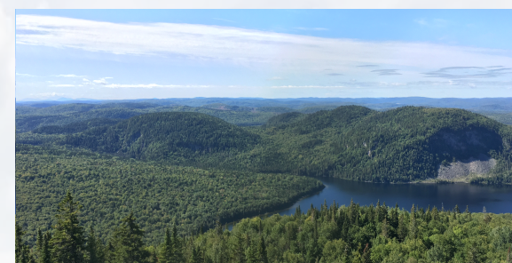
Deboullie Mountain, Aroostook County, Maine.