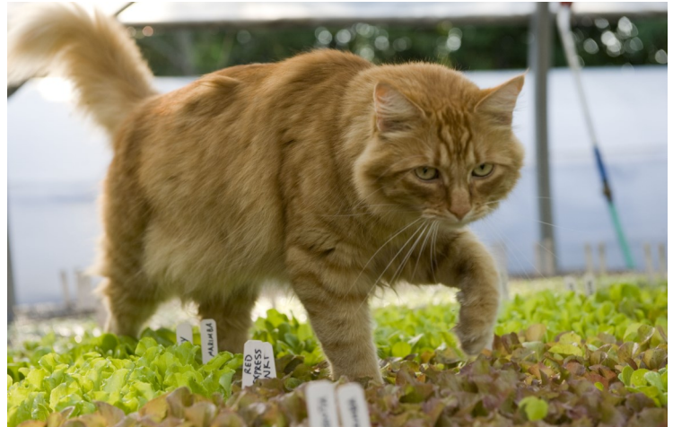
https://commons.wikimedia.org/wiki/File:Cat_in_the_greenhouse - Be sure to wash lettuce before eating (2596864629).jpg

The CDC estimates that more than 40 million people in the US carry T. gondii , many without obvious symptoms.