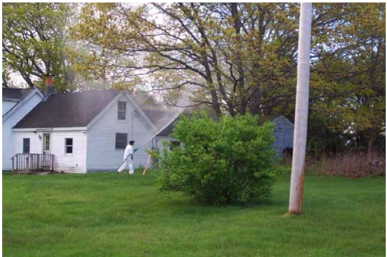
Figure 7. Freeport application.