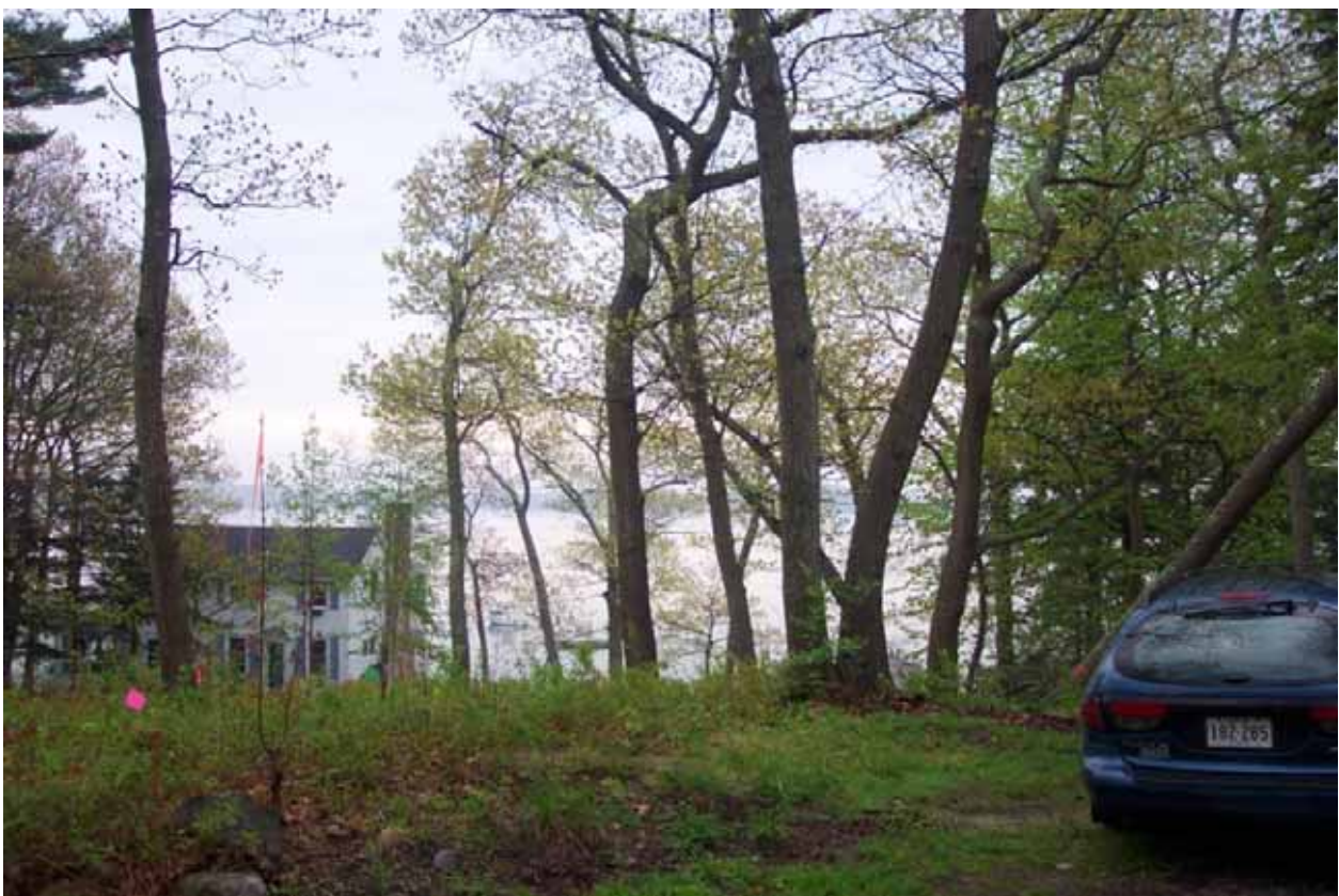
Figure 3. Falmouth target area is three trees about 50' from water and drift cards were set up further away from the water (down wind), and at water's edge.