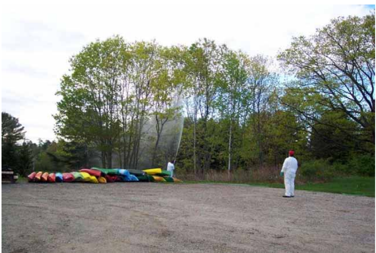
Figure 9. More Freeport application. Sprayer pointed toward drift cards.