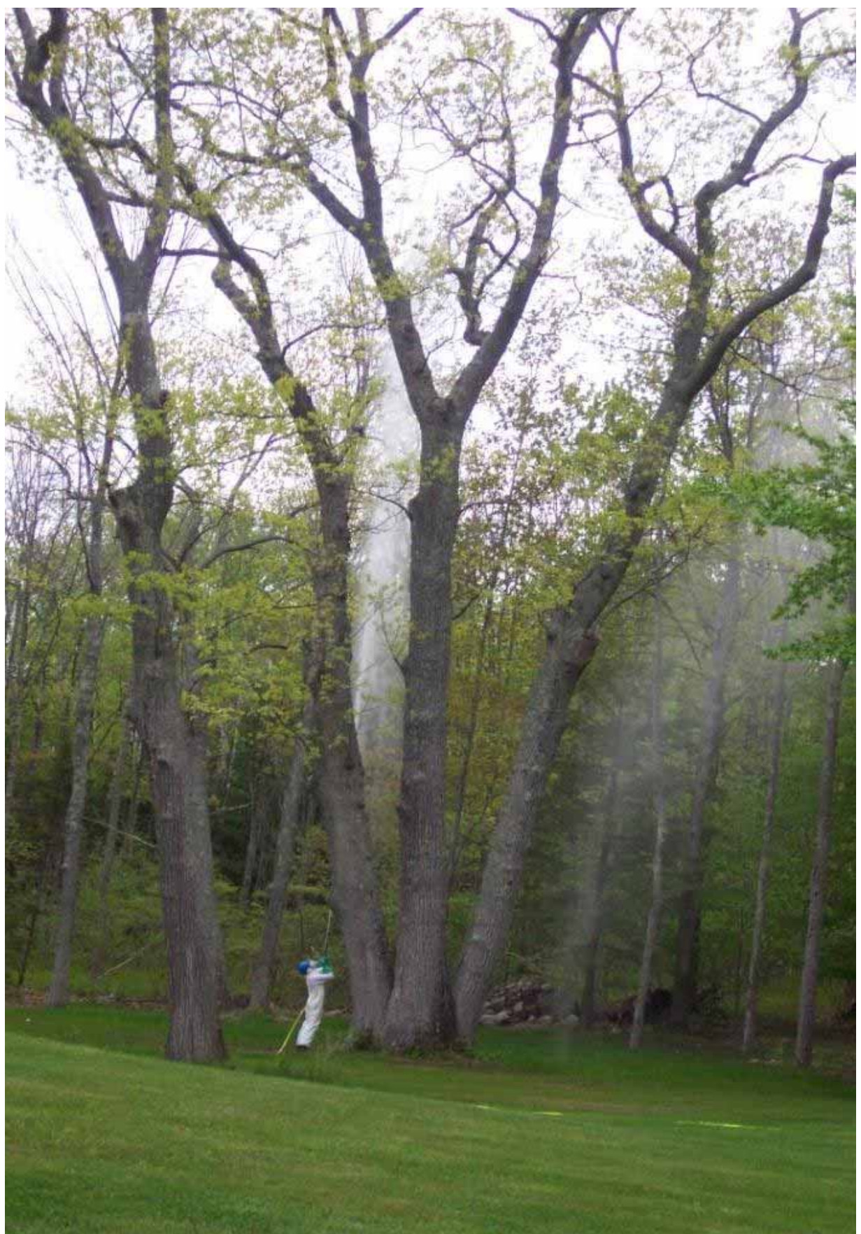
Figure 5. Harpswell application.