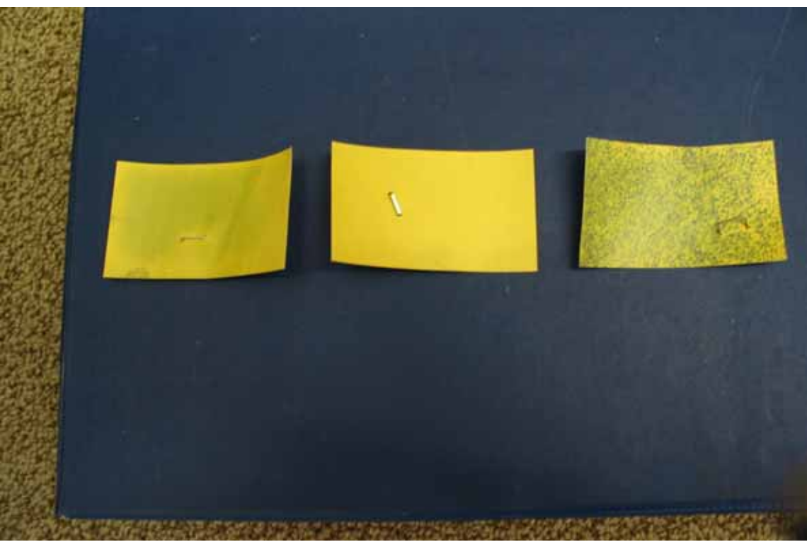
Figure 12. Water sensitive cards from the Freeport site from left to right: 250', 150', and 50' downwind from target. Very small liquid droplets are just barely visible on the yellow cards that were 250' and 150' from the target.

Figure 11. Yarmouth drift cards set up in this area. Ocean is down this hill over 250' from target area. Slight movement of air toward the water during this spray event.