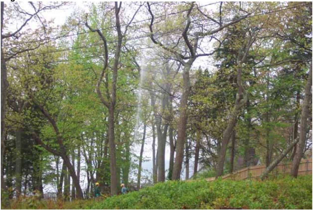
Figure 4. Falmouth application.