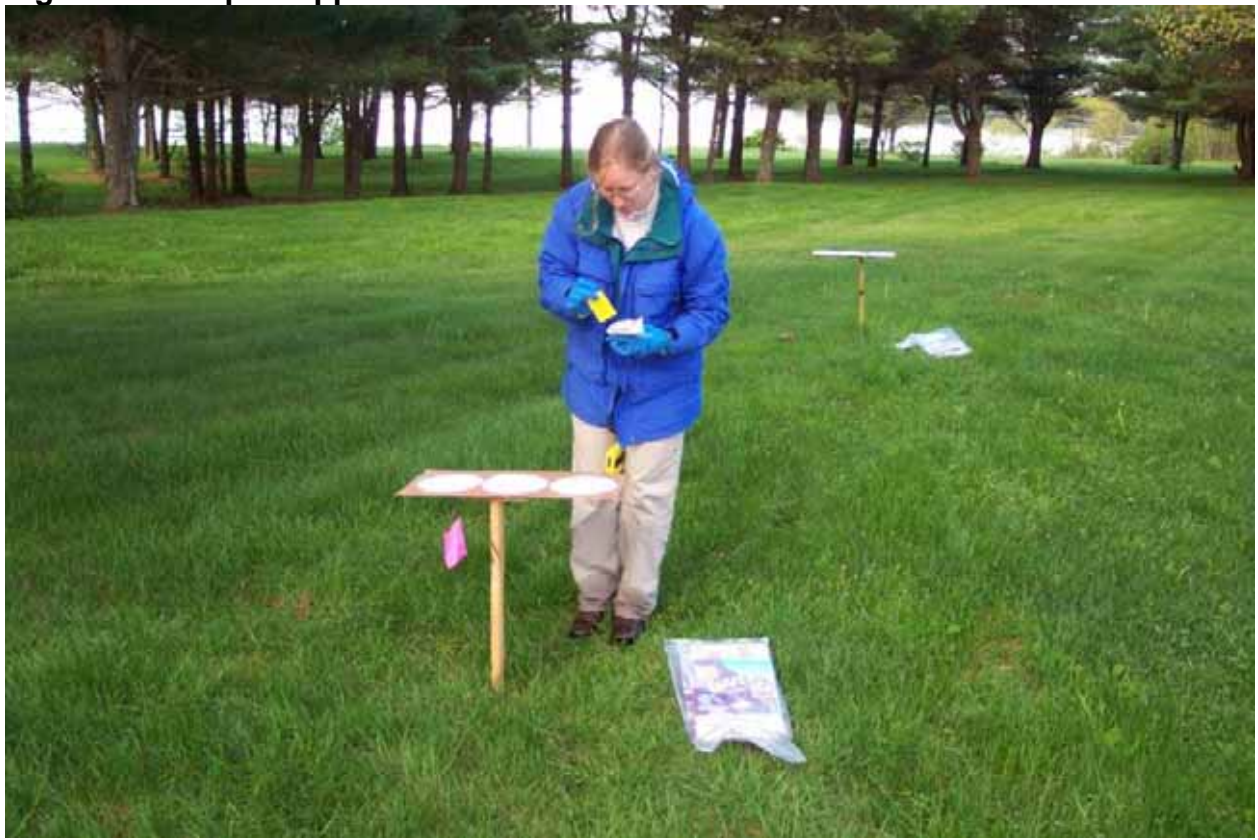
Figure 8. Freeport drift cards.