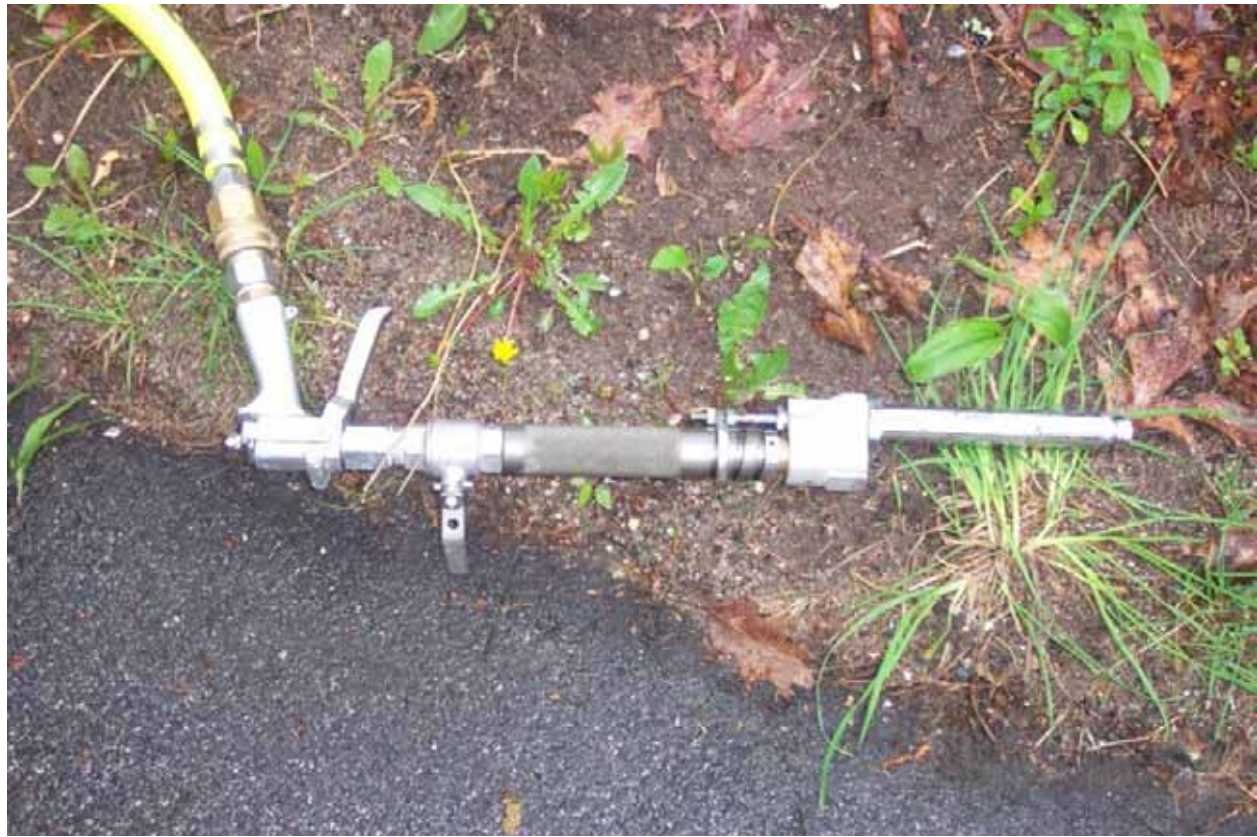
Figure 2. Nozzle used in Falmouth.