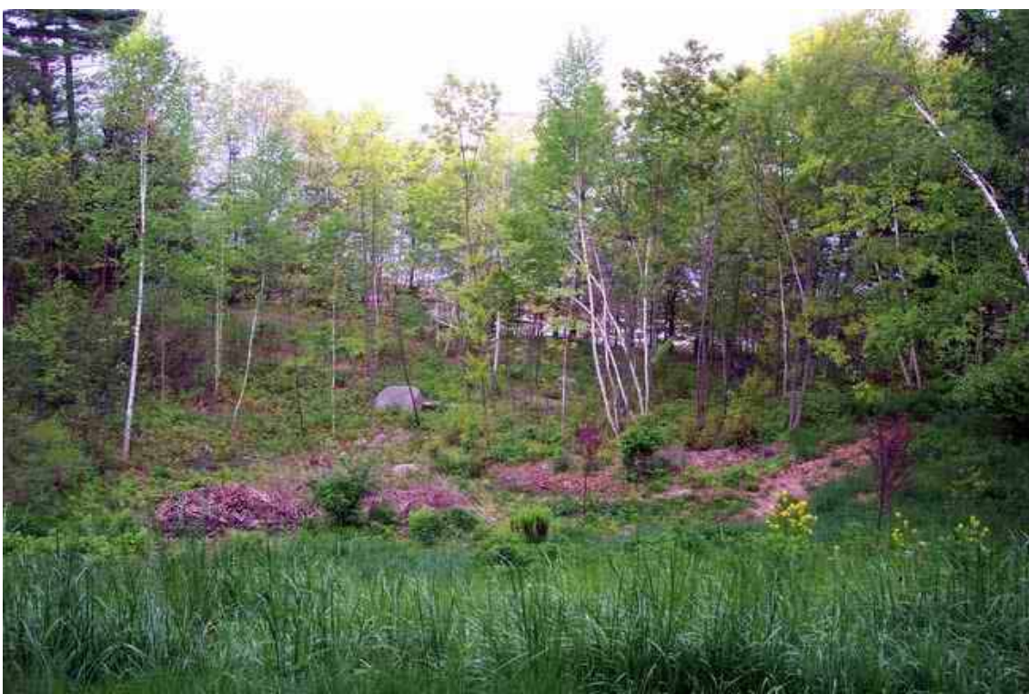
Figure 11. Yarmouth drift cards set up in this area. Ocean is down this hill over 250' from target area. Slight movement of air toward the water during this spray event.