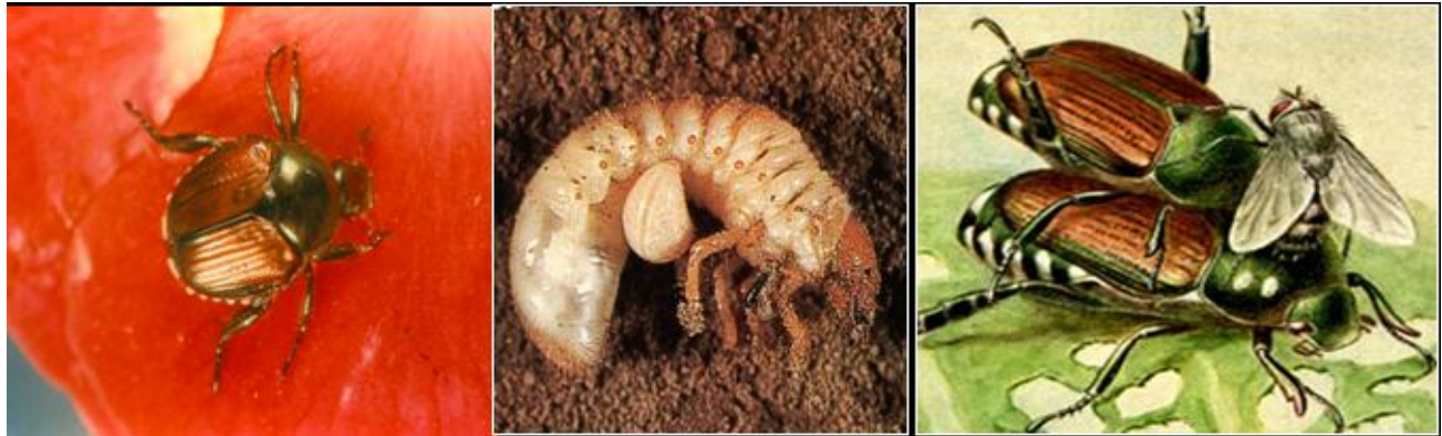
Figure 1. Adult Japanese beetle on a rose petal (left), T. vernalis larva feeding on a Japanese beetle grub (center), aldrichi depositing an egg on the pronotum of a Japanese beetle.

In 1999 and 2000, the most promising parasites and pathogens of Japanese beetle ( Tiphia vernalis , Istocheta aldrichi and Ovavesicula popilliae , were collected in Connecticut and introduced to 5 golf course sites in Michigan (Fleming 1968, Figure 1). Tiphia vernalis is already established in several eastern states, including Tennessee, where it is believed to be helpful in limiting populations of Japanese beetle. Istocheta was introduced from Japan into several eastern states about 50 years ago and is now