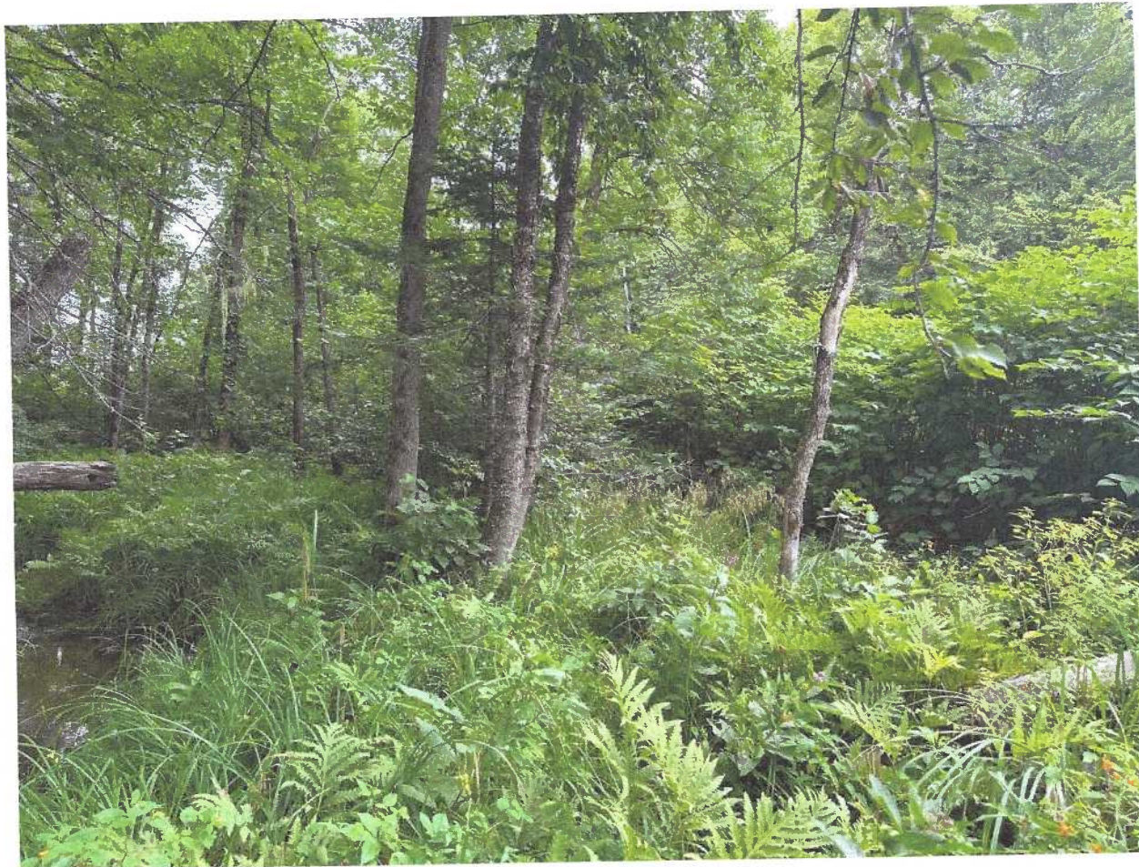
Knotweed growing on right side of stream (left side of picture). Knotweed does not grow up to stream but is with 25 ft of stream.