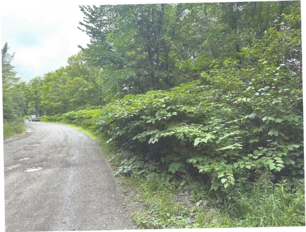
Knotweed growing along Forested Oxbow road. About 120 yards long and 10-40 feet wide.