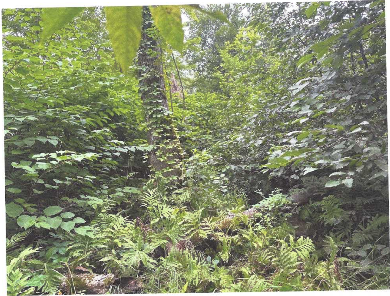
The closest the knotweed gets to the stream. Knotweed on the left, stream to the right.