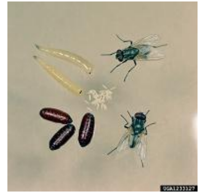
Life Cycle of the house fly Musca domestica.

House flies, blue and green bottle flies, and flesh flies breed in garbage and/or animal feces and are generally referred to as filth flies. They pass through four distinct stages in their life cycle: egg, larva (maggot), pupa, and adult. These flies can detect odors across long distances. Smells of souring milk from hundreds of containers thrown in dumpsters can attract thousands of flies from the surrounding neighborhood. Sanitation is the key to preventing fly problems.