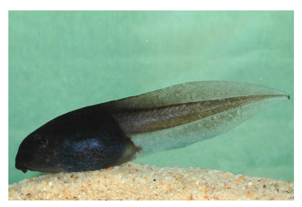
Wikipedia: The Free Encyclopedia wikipedia.org