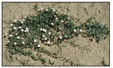
Figure 1. Field bindweed.

Field bindweed is a prostrate plant unless it climbs on an object for support. It often is found growing on upright plants, such as shrubs or grapevines, with its stems and leaves entwined throughout the plant and the flowers exposed to the light (Fig. 4). Under warm, moist conditions, leaves