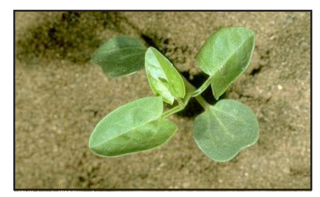
Figure 3. Field bindweed seedling.

are larger and vines more robust than under drought conditions.