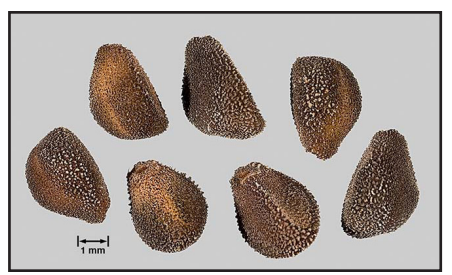
Figure 8. Field bindweed seeds.

bindweed propagules. It is important to control new infestations when they are small, because spot control is the least expensive and the most effective strategy.