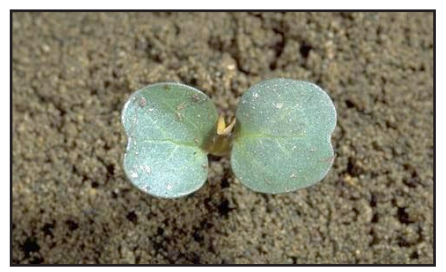
Figure 2. The first two leaves (cotyledons) of a field bindweed seedling are notched.