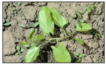
Figure 7. Field bindweed plants developing from underground roots or rhizomes don't have seed leaves.