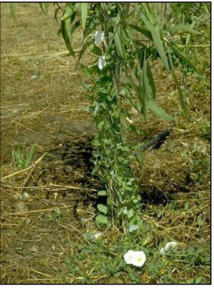
Figure 4. Field bindweed climbing up the stem of a shrub.

The root system has both deep vertical roots and shallow horizontal lateral roots (Fig. 5). The vertical roots can reach depths of 20 feet or more. However, 70% of the total mass of the root structure occupies the top 2 feet of soil. Most of the lateral roots are no deeper than 1 foot. Experiments on bindweed have shown that its root and rhizome growth can reach 2 1/2 to 5 tons per acre.