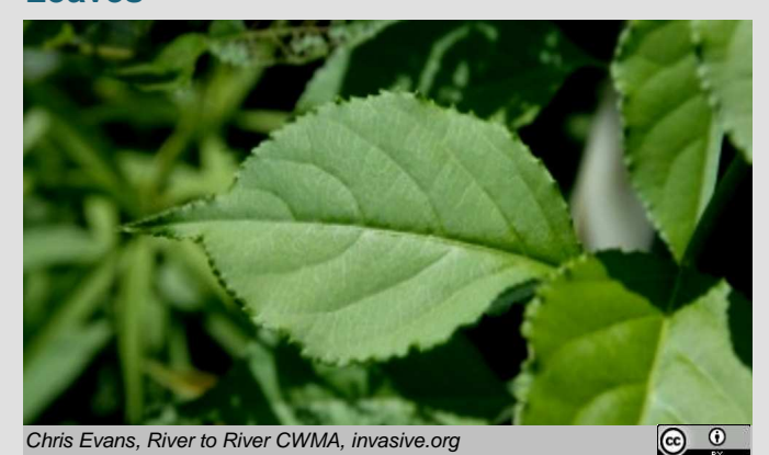
Look for glossy leaves that are almost round with long pointed tips. Each leaf is 5 to 13 cm long and its edges are finely toothed.