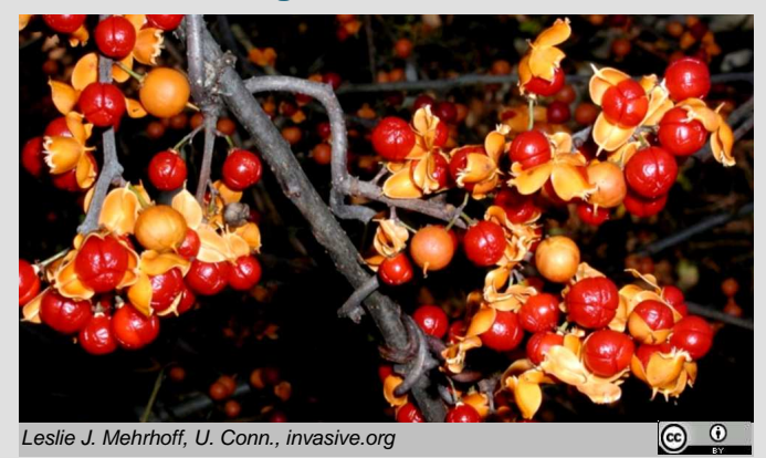
From June to August look for clusters of small green flowers. After August look for bright red fruit with thin yellow skins.