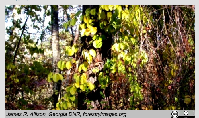
Look for a woody vine growing up to 18.5 m long and climbing on living (trees, shrubs) or non-living (buildings, telephone poles) support.