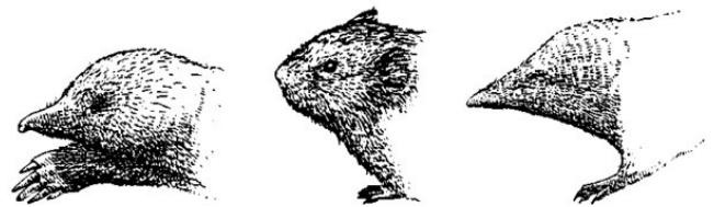
Left to right: Mole, vole, and shrew.

Voles are frequently mistaken for moles, shrews, and mice. Moles have greatly enlarged front feet, with prominent digging claws. Moles also have no external ears and very small eyes. Shrews are smaller than voles, and have long, pointed snouts and pointed front teeth, with their eyes and ears nearly hidden in their fur. Voles have rounded, blunt snouts, and their front teeth are chisel-shaped. Their eyes and ears are readily apparent. The distinction between voles and mice is less obvious. The best way to distinguish them is by tail length. Mice have long tails that extend nearly half their body length, whereas voles have short tails.