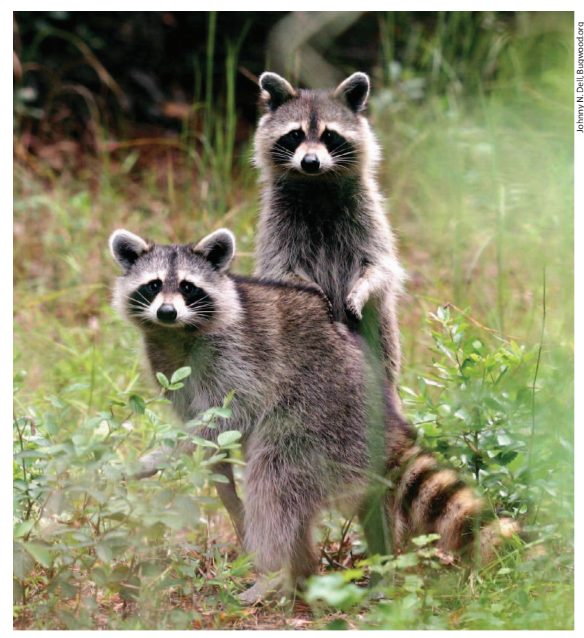
Yearling raccoons stay closer to their place of birth, but adults may travel up to 150 miles.

Raccoons do not make good pets. Young raccoons are frequently found after the raccoon family is evicted from a chimney or attic, or after the mother meets with an accident. Resist the urge to care for the cute babies beyond assuring their immediate survival. Wisconsin law does not allow taking wild animals as pets. If you are certain that the young raccoons are orphaned, make every attempt to locate a nature