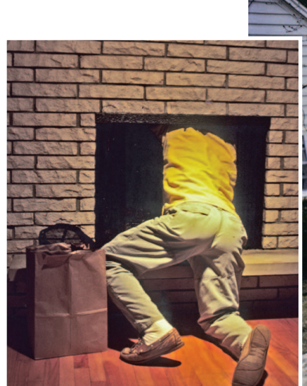
After visually inspecting the chimney to make sure it is clear, install a chimney cap to keep raccoons and other pests out.