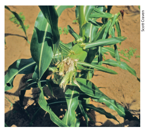
Corn damaged by a raccoon.

In large commercial corn fields, the only source of relief from damage may be to reduce the