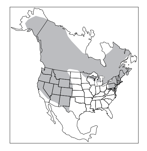
Fig. 2. Range of the porcupine in North America.

The porcupine is a common resident of the coniferous forests of western and northern North America (Fig. 2). It wanders widely and is found from cottonwood stands along prairie river bottoms and deserts to alpine tundra.