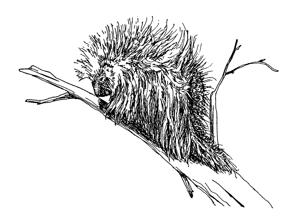
Fig. 1. Porcupine, Erethizon dorsatum