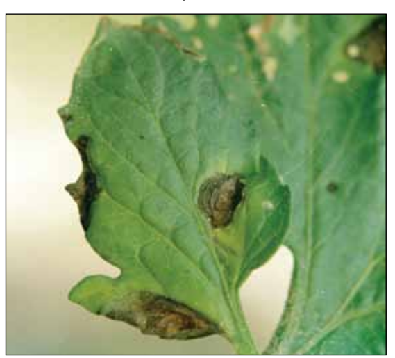
Figure 2. Early blight lesions on tomato leaves usually have a target-like appearance.

blight is the formation of dark, concentric rings within the lesion, giving the spots a targetlike appearance (Figure 2).