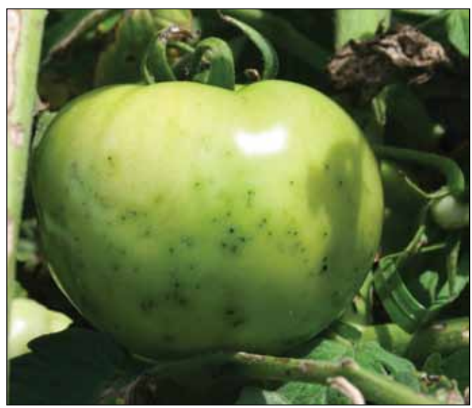
Figure 4. Bacterial speck causes tiny black lesions on fruit.

Bacterial canker, a third bacterial disease, can be a serious problem in commercial and small garden tomato plantings. This disease can cause lesions or cankers on any portion of the plant, including the fruit, or it can result in a general wilt or decline of the plant. Diseased tomatoes first exhibit yellowing and wilting of leaves on a portion of