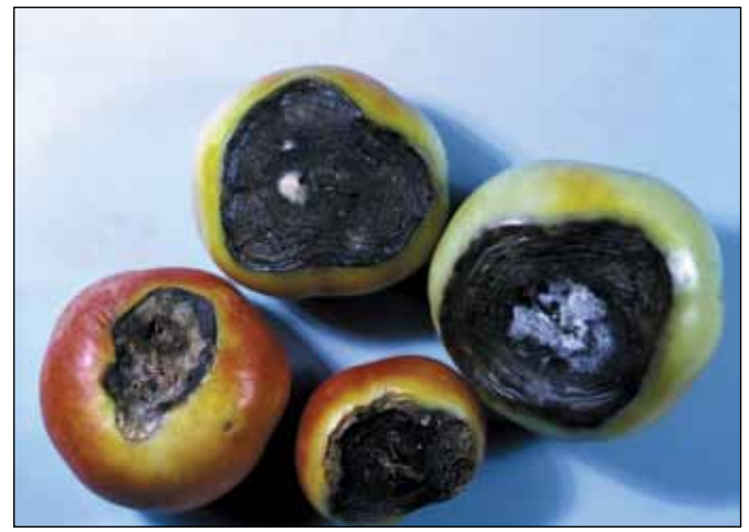
Figure 8. Blossom end rot causes sunken, water soaked lesions that eventually turn black.

Growth cracking occurs on tomato fruit that expand too quickly. It is most common on nearly ripe fruit, but it can occur on younger fruit. Cracks develop in concentric circles around the stem scar (Figure 10). They also can