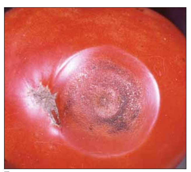
Figure 3. Anthracnose causes circular, sunken areas on ripening fruit which later support numerous fungal spore-producing structures (black specks).

Homeowners can refer to Table 1. Commercial growers should consult the Midwest Vegetable Production Guide for Commercial Growers ; a management guide published every year. Contact your local K-State Research and Extension Office or the K-State Plant Diagnostic Lab for ordering information.