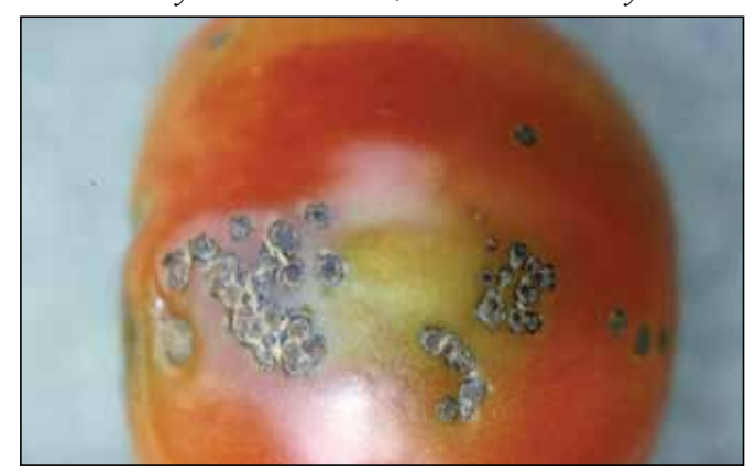
Figure 5. Bacterial spot causes lesions up to ¼ inch that are often rough or cracked in appearance.