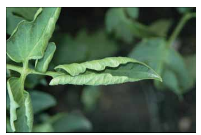
Figure 9. Physiological leaf roll.