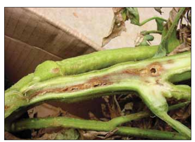
Figure 6. Bacterial canker can cause a rotting in the stem, visible as discoloration when the stem is cut.

least 1 year. During the growing season, the small bacteria are dispersed by water (irrigation or rain) and infect plants through wounds or natural openings. Once inside the plant, the organism can invade the water-conducting tissue and be carried systemically throughout the plant.