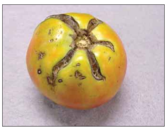
Figure 11. Radial growth cracks.

Select cultivars less prone to cracking. Provide even water and balanced nutrition to avoid overly lush growth. Limit fruit exposure to sun through proper staking or trellising, and by managing foliar diseases.