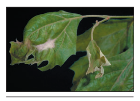
Figure 1a. Powdery mildew ( Micros-phaera alni ) caused white patches and distorted these sycamore leaves.

The best method of control is prevention. Avoiding the most susceptible cultivars, placing plants in full sun, and following good cultural practices will adequately control powdery mildew in many situations. Some ornamentals do require protection with fungicide sprays if mildew conditions are more favorable, especially susceptible varieties of rose and crape myrtle. (See Table 1.) For a list of other common ornamentals susceptible to powdery mildew, see Table 2.