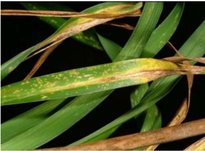
Figure 1. Symptoms include yellow leaf spots and streaking on the surface of the leaves

Daylily rust, caused by the fungus Puccinia hemerocallidis , is a relatively new disease in the United States. The pathogen was first described in 1880. It is native to Asia, commonly found in China, Japan, Korea, Taiwan, and Russia. In the U.S., it was first identified in August of 2000 in the southeastern part of the country. The disease moved swiftly throughout the country and by the fall of 2001 it had been identified in over 30 states including New York State. The reason for such a fast movement of the pathogen is most likely due to the widespread, fast shipping of plant material throughout the country.