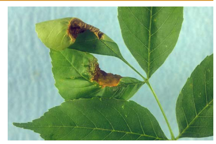
Figure 3. Ash anthracnose

Leaves develop irregular water soaked or blackish green blotches that eventually turn black or brown (figure 3). The blotches develop from the margin inward and are usually limited only by the midvein. Leaflets curl toward the blighted area. Ash anthracnose symptoms develop in mid spring and are often followed by sudden premature drop of affected leaflets.