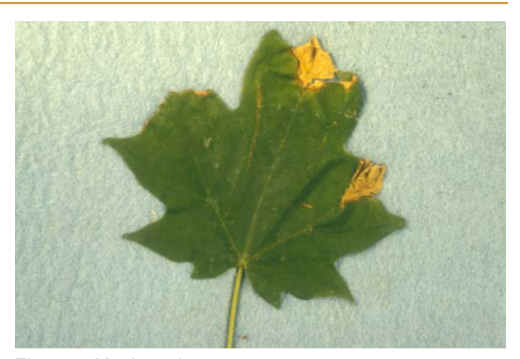
Figure 4. Maple anthracnose

Large brown to tan areas of leaf tissue develop in mid to late spring and may cover much of the leaf surface (figure 4). Death of leaf tissue is limited by the major leaf veins. Affected tissue becomes papery and leaves may appear tattered or shredded later in the growing season.