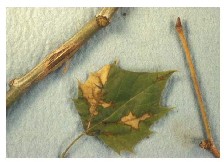
Figure 2. Sycamore anthracnose

Failure of sycamore trees to leaf out in the spring is due to the blighting or death of buds and young shoots (figure 1). Severe bud and shoot blight produces sparsely foliated trees with leaves only at branch tips. Foliar symptoms are small to large reddish brown to brown areas, centered on or directly adjacent to and following leaf veins. Cankers on small diameter branches and twigs are elliptical, rough areas in the bark with depressed centers and raised margins (figure 2). Repeated infection of shoot tips results in gnarled or bushy branch growth (witches brooming).