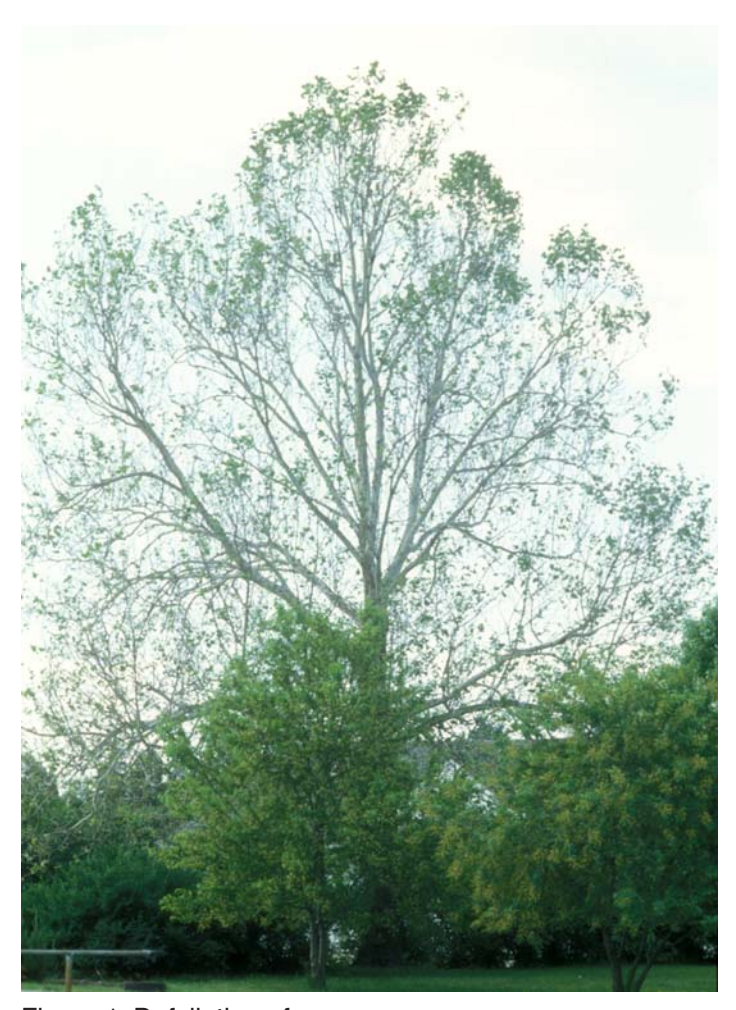
Figure 1. Defoliation of sycamore

Anthracnose is one of the most common and important foliage diseases of shade trees in Iowa. Symptoms of anthracnose are often referred to as "leaf blights" or "leaf spots" and are most serious on sycamore, ash, maple, white and bur oak, and walnut. Linden, hickory, elm, red and black oak, and other deciduous trees also are susceptible, although anthracnose is less common and damaging on these species.