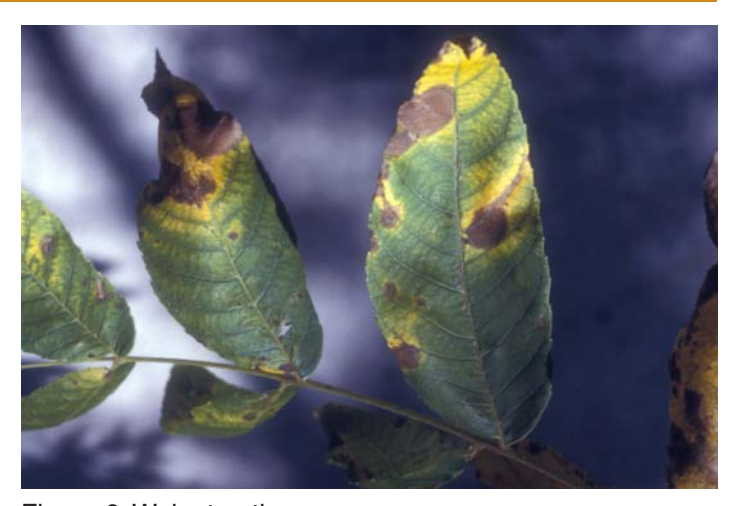
Figure 6. Walnut anthracnose

Small (less than \frac{1}{16} inch in diameter) to large ( \frac{1}{16} inch and greater) black spots that often merge together appear in midsummer (figure 6). Yellowing of foliage and extensive leaf loss or defoliation occurs in the latter part of the summer. Symptoms also appear on the husks and may cause nutmeats to shrivel. Small black bumps, the fruiting bodies of the fungus, may be evident when lesions are observed with a hand lens.