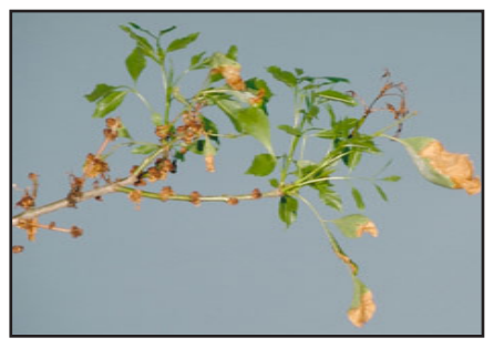
Figure 2. Terminal dieback and partly killed Modesto ash leaves due to ash anthracnose.