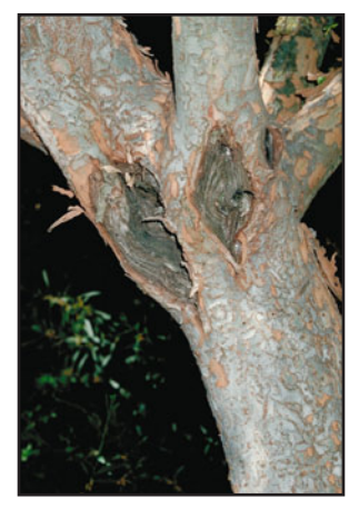
Figure 5. Chinese elm anthracnose cankers.