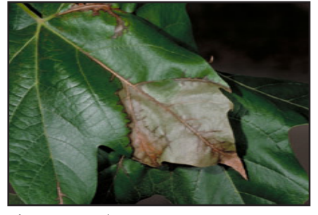
Figure 3. Anthracnose symptoms on a sycamore leaf.

anthracnose. For new plantings, choose varieties that are resistant to these fungi. Space the plants far enough apart to maximize air circulation and increase sunlight, both of which facilitate faster drying of leaf surfaces when trees are fully grown.