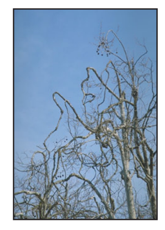
Figure 4. Sycamore limbs distorted by anthracnose infection.

While pollarding—severe pruning that removes all of the previous year's growth—isn't recommended for most trees, you can use this method on London plane trees to control anthracnose, because it removes pathogen-infected shoots. However, pollarding increases susceptibility of London plane trees to