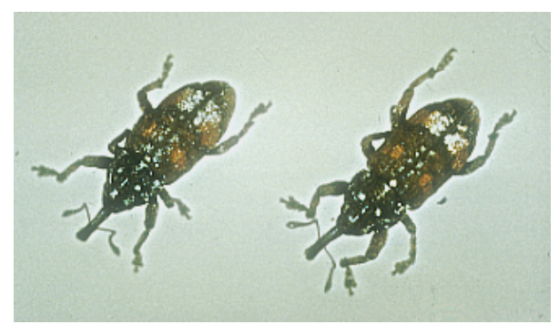
White Pine Weevil Adults