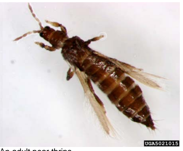
An adult pear thrips.