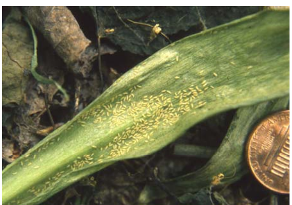
Pear thrips larvae clustered on a leaf on the ground, after being washed off the tree leaves by heavy rain, in late May, just prior to going underground to pupate.