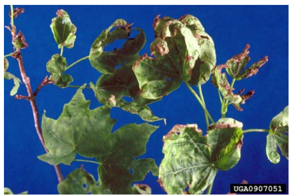
Maple leaf damage from Pear thrips