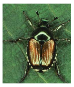
The Japanese beetle adult an attractive pest.