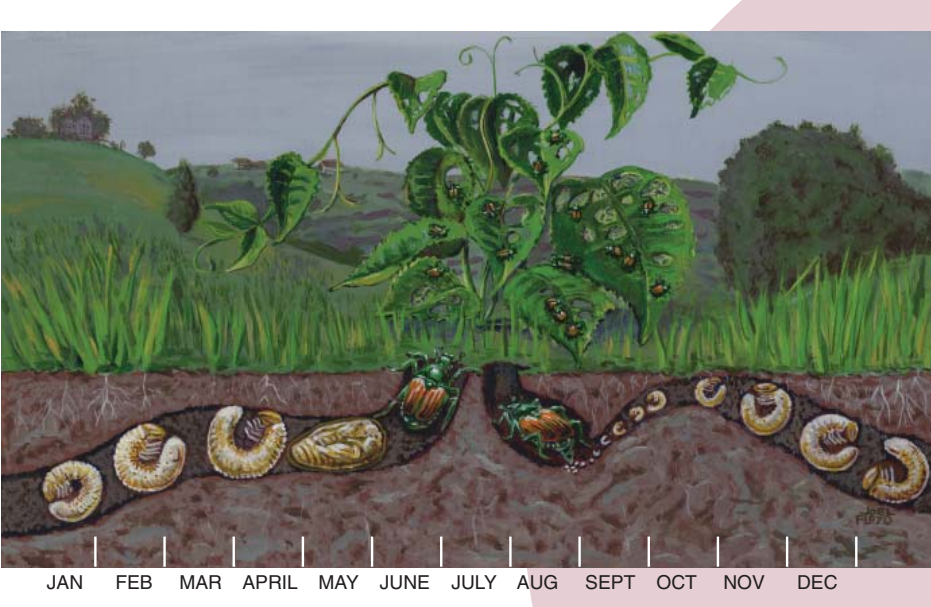
The Japanese beetle life cycle.

Plant Health Inspection Service (APHIS) have developed an integrated pest management (IPM) program for homeowners based on field experiences. The program combines biological, cultural, and chemical strategies. It will be effective if homeowners are willing to monitor both adult and larval beetle populations closely and implement this program with neighbors and their local agricultural or horticultural organizations.