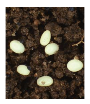
A typical cluster of Japanese beetle eggs.

Both as adults and as grubs (the larval stage), Japanese beetles are destructive plant pests. Adults feed on the foliage and fruits of several hundred species of fruit trees, ornamental trees, shrubs, vines, and field and vegetable crops. Adults leave behind skeletonized leaves and large, irregular holes in leaves. The grubs develop in the soil, feeding on the roots of various plants and grasses and often destroying turf in lawns, parks, golf courses, and pastures.