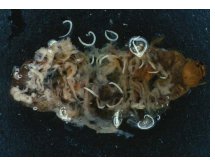
A dissected Japanese beetle larva showing later stages of the Heterorhabditis bacteriophora nematode.

Nematodes—Insect-eating nematodes—microscopic parasitic roundworms—actively seek out grubs in the soil. These nematodes have a mutualistic symbiotic relationship with a single species of bacteria. Upon penetrating a grub, the nematode inoculates the grub with the bacteria. The bacteria reproduce quickly, feeding on the grub tissue. The nematode then feeds on this bacteria and progresses through its own life cycle. reproducing and ultimately killing the grub.