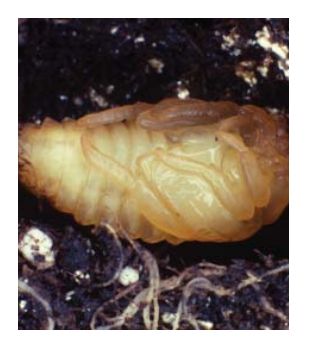
Japanese beetle pupa.

smaller than the females. You are most likely to see the adults in late spring or early summer.