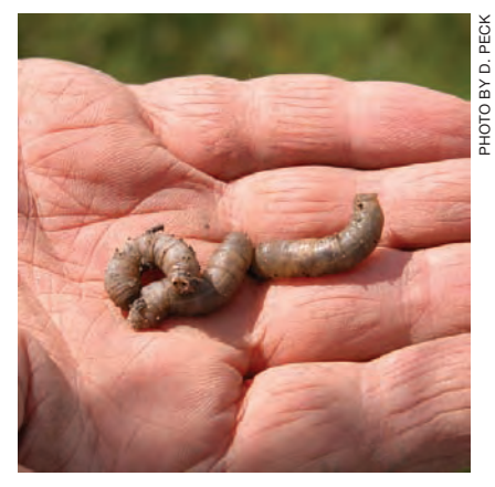
Figure 1a. European crane fly larvae (T. paludosa).

There are several species of native and non-injurious crane flies in NY that inhabit grassy habitats and can be found emerging from turfgrass. Like many of them, T. paludosa and T. oleracea adults resemble oversized mosquitoes, but they do not feed and are weak (T. paludosa) to modest (T. oleracea) fliers. One