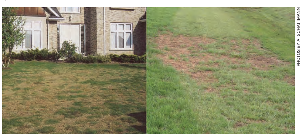
Figure 1b. Damage due to severe leatherjacket infestation in home lawns (T. paludosa).