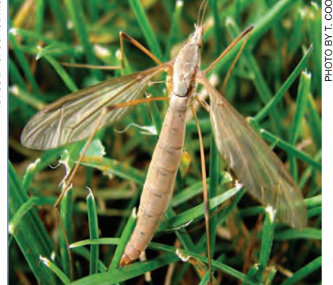
Figure 3. European crane fly eggs, fourth instar larva, pupa, pupal exuvia and adult (T. paludosa).