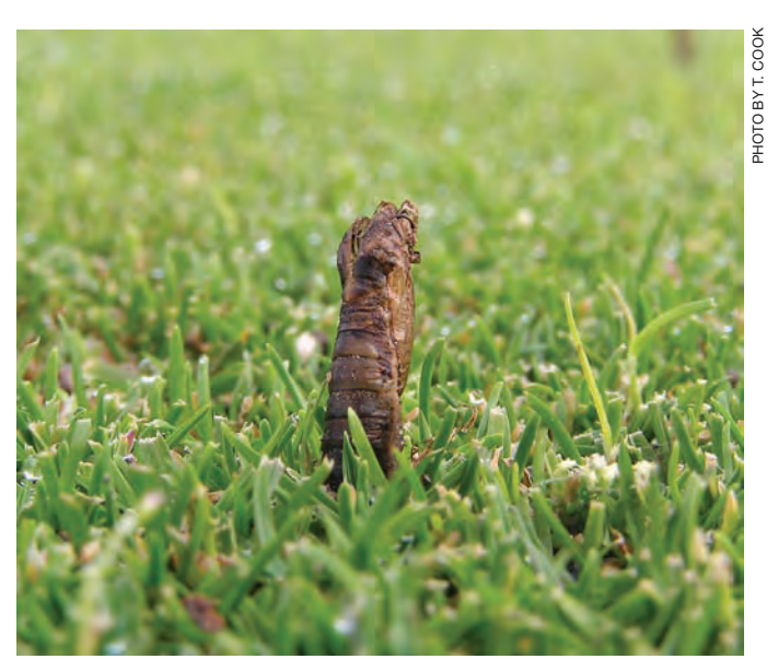
Figure 4. Empty pupal case protruding from low-mown turf after emergence of the adult ( T. paludosa ).

If signs of insect activity and turfgrass injury suggest leatherjackets, core sampling is the best way to detect and sample larvae. Take samples with a cup cutter and rip apart the core to look for larvae. Depending on the insect's life cycle and field