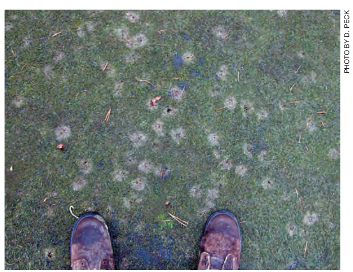
Figure 2. Late winter damage due to leatherjacket infestation in a golf course green ( T. oleracea ).

Adults are 2.5-3.0 cm long, pupae 3.0-3.5 cm, mature larvae 3-4 cm and eggs 1.0 x 0.5 mm. They complete one ( T. paludosa ) or two ( T. oleracea ) generations a year, with the emergence of adults occurring over a period of a few to several weeks at any one site, over the period of early spring ( T. oleracea ) and late July to September (both species). Adult females will emerge, mate and lay most of their eggs all within the first day ( T. paludosa ) or 3-4 days ( T. oleracea ) of their brief reproductive lives, either in a single batch because gravid females are unable to fly any distance ( T. paludosa ) or in several batches because gravid females are more capable fliers ( T. oleracea ). Each will deposit up to 200-300 black eggs at or near the soil surface. Eggs are sensitive to drought and require wet conditions to survive, hatching in 1 ( T. oleracea ) or 1.5-2 ( T. paludosa ) weeks.