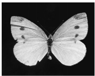
Adult, the "Cabbage white" butterfly.

[Cabbage white butterfly]; Pieris rapae (Linnaeus); Family: Pieridae