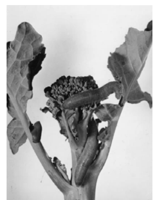
Mature larvae on broccoli.