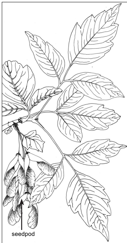
Figure 3. Leaves and seedpods of female box elder tree.

points into the home and consider removing female box elder trees. Sanitation practices such as vacuuming can be used to reduce population numbers, but vigilance may be required during fall migration. Insecticide use is rarely justified.