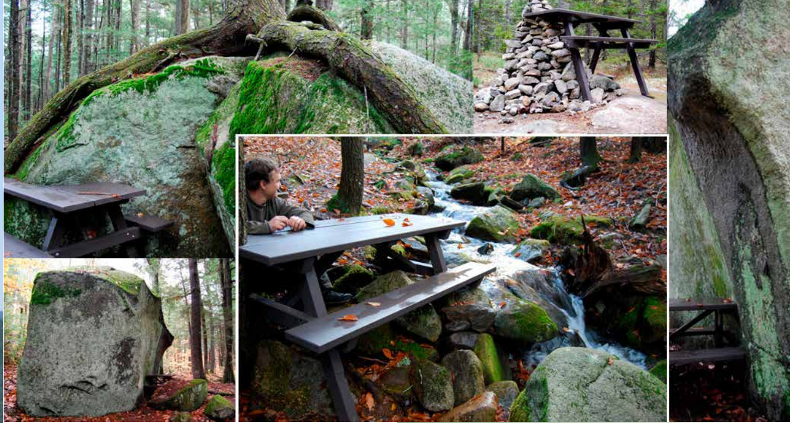
Twelve picnic table “sculptures” were created in the park by Artist Wadw Kavanaugh through Maine’s Percent for Art Act.