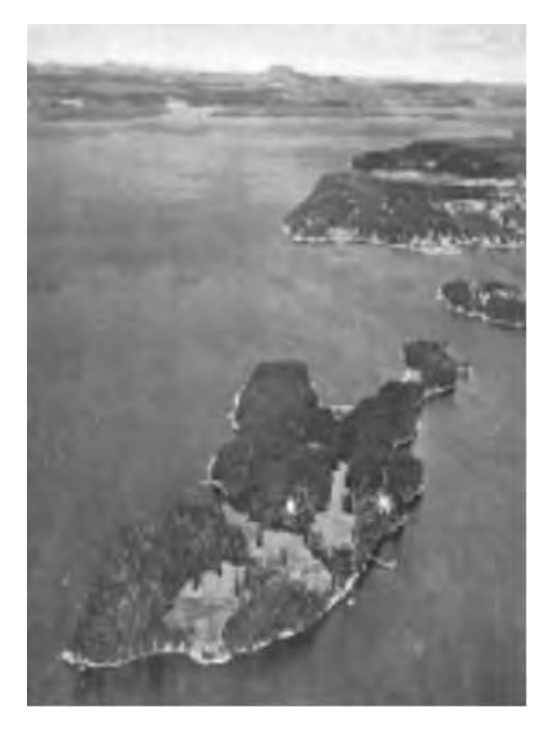
"A unique coastal treasure"

Holbrook Island Sanctuary State Park 172 Indian Bar Road Harborside, Maine 04642