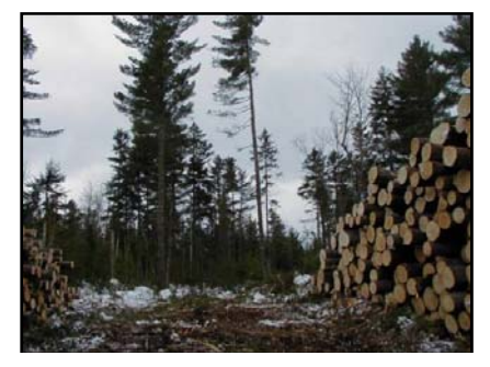
Harvest operation at Richardson Lakes

Bureau staff closely supervises each harvest by marking individual trees for removal or by providing loggers with strict harvesting criteria. These criteria specify which trees are to be harvested. All harvest operations are inspected by Bureau staff on a weekly basis; more often when individual situations warrant.