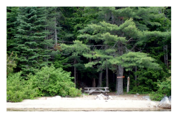
Campsite on Nahmakanta Lake

An additional recreation management project involved a survey of boats stored at remote ponds on the Nahmakanta Unit. Boat owners were notified of upcoming enforcement of the boat storage policy, which has been established to protect the character of remote ponds.