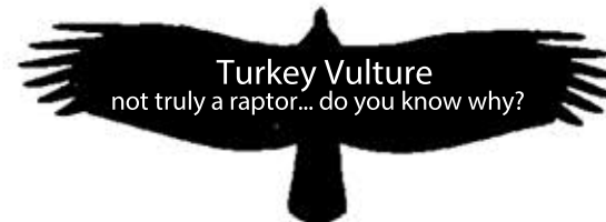
Turkey Vulture not truly a raptor... do you know why?