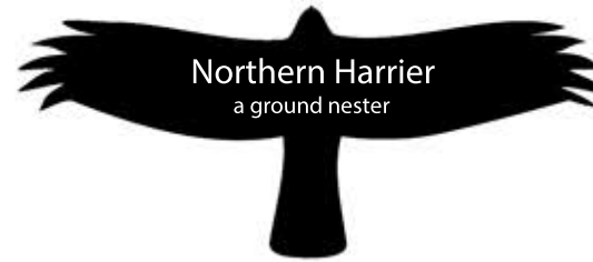
Northern Harrier a ground nester