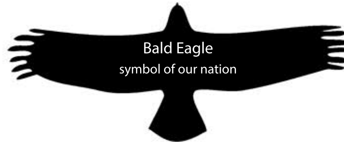
Bald Eagle symbol of our nation