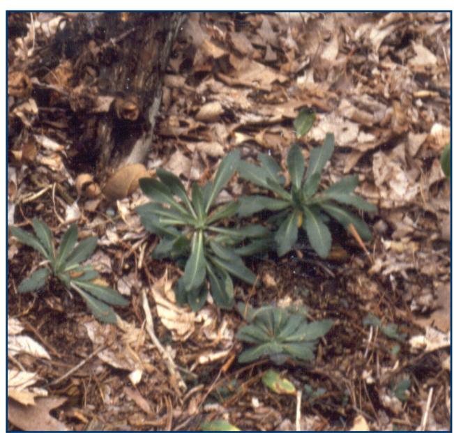
Missouri Rockcress, Maine Natural Areas Program

» Habitat Connections: With expected changes in climate over the next century, plant and wildlife species will shift their ranges. Maintaining landscape connections between undeveloped habitats will provide an important safety net for biodiversity as species adjust their ranges to future climate conditions.