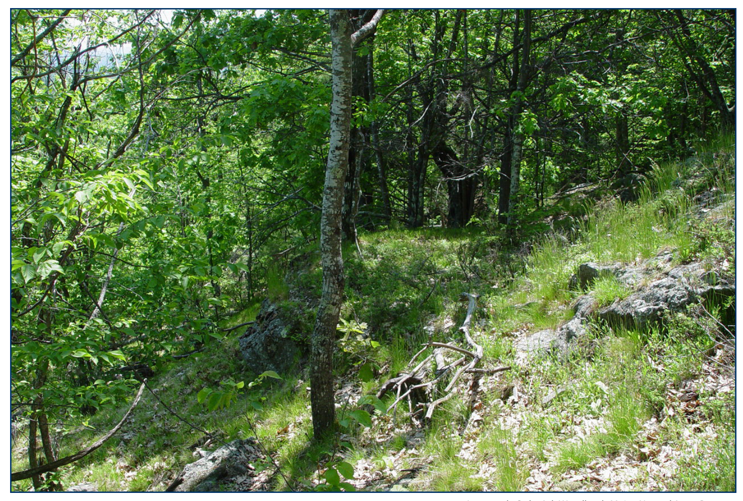
Ironwood - Oak - Ash Woodland, Maine Natural Areas Program