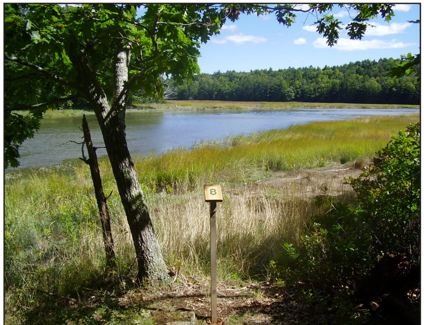
Marsh River, Sheepscot Valley Conservation Association

For more information about Focus Areas of Statewide Ecological Significance, including a list of Focus Areas and an explanation of selection criteria, visit www.beginningwithhabitat.org