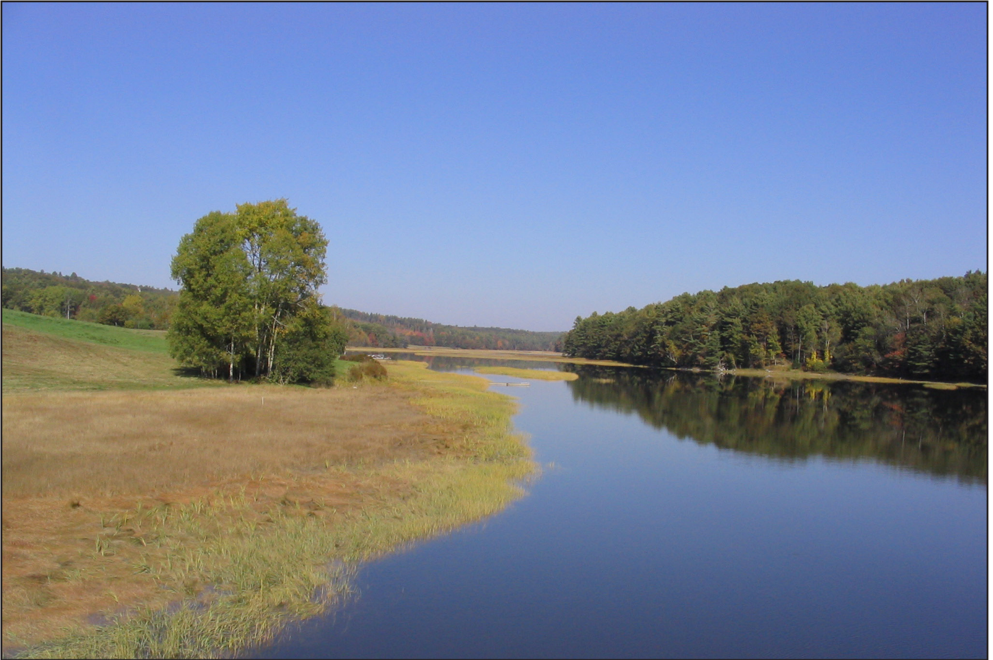
Northward view of the Sheepscot River from the Sheepscot Village Bridge, Sheepscot Valley Conservation Association