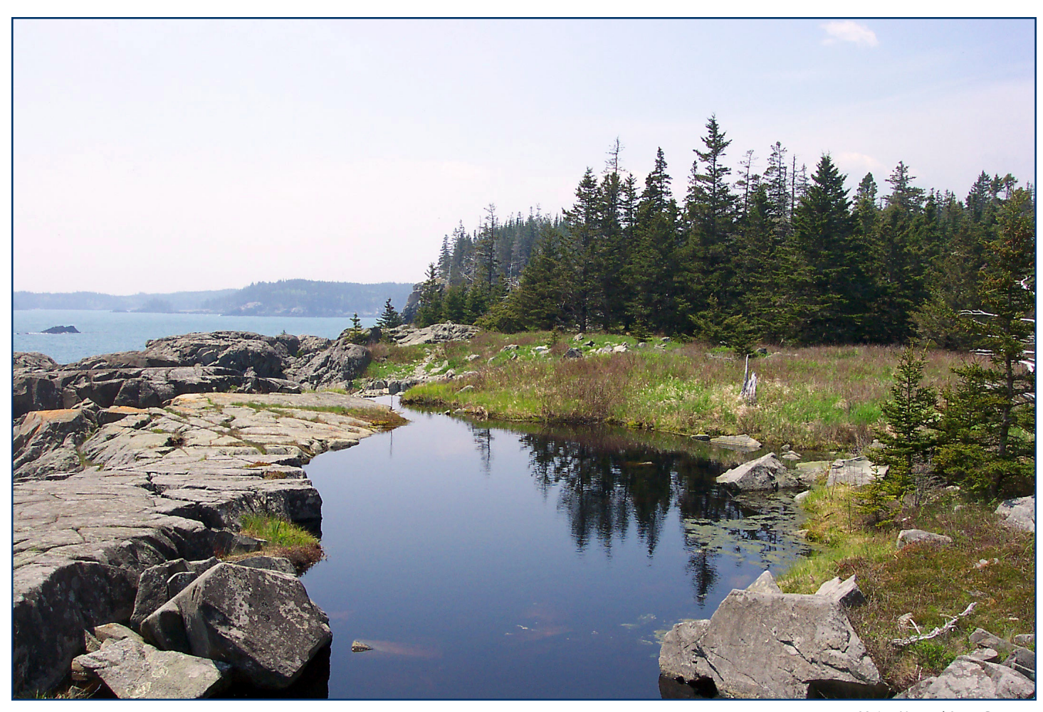
Maine Natural Areas Program