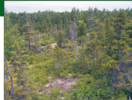
Spruce - Pine Woodland

Other upland coniferous woodlands may include red spruce but will have other tree species (northern white cedar, pitch pine, red pine, jack pine, or black spruce) in greater abundance. Oak - Pine Woodlands may have considerable red