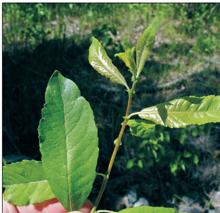
Pussy Willow Leaves

Sites occupy shores of larger rivers, below the annual high-water line, in areas somewhat protected from the extremes of ice scour and flooding. Riverbanks are moderate to steep, not flat; and the silty to sandy soils are not constantly saturated. Successional dynamics have not been studied, but at least some sites appear to persist through disturbance.