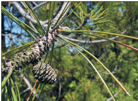
Red Pine Needles and Cone

Sites are usually on flats, slopes of <25% or low ridges (<1000'), on dry-mesic to xeric soils that are somewhat to very shallow (10-50 cm to obstruction, usually bedrock). Soils are coarse (sandy loams to sands) and acidic (pH 4.8-5.2). Many sites have evidence of past fires.