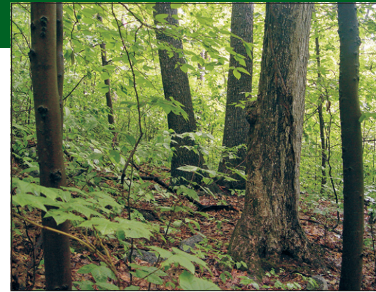
Oak - Northern Hardwoods Forest

isolated protected stands (on the order of 25 acres or less) may not be viable in the long run; though larger stands, or naturally small stands protected within a managed forest matrix, could be viable.