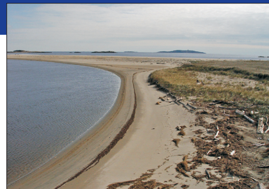
Beach Strand - Morse Mountain

This narrow band of vegetation usually lies landward of the most heavily walked portions of beaches and has likely been reduced or eliminated at popular beaches. Many examples exist on several public lands and private conservation lands. Raking seaweed from the beach to the dune fronts can affect the composition of this community. The prospect of sea level rise may also put these systems at greater risk.