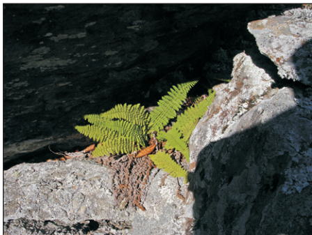
Fragrant Wood Fern

This community occurs on low- to mid-elevation (<2700') outcrops of limestone, dolomite, or other rock where weathering produces circumneutral to calcareous substrates. Sites are usually below the hill summit, on side slopes or cliffs rather than ridges. Slope varies, often with vertical faces and near horizontal shelves within the same area. Sites are typically dry but may have moist spots where seepage occurs.