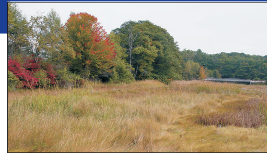
Brackish Tidal Marsh

Tidal marshes provide valuable wildlife habitat and have received considerable