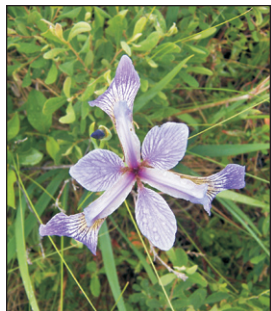
Northern Blue Flag

freshwater species, such as pickerelweed and common arrowhead, are absent.