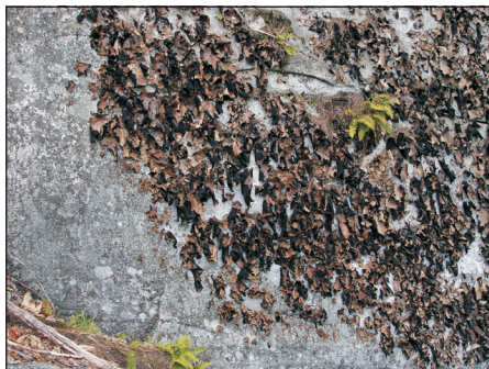
Rock Tripe and Rock Polypody

Sparsely vegetated cliffs occur below treeline, without circumneutral indicator species.