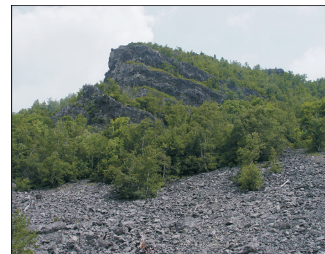
Acidic Cliff - Gorge

Landscape Pattern: Small Patch. The minimum mapping unit is 5,000 square feet of rock exposure; smaller ledges and outcrops should be considered as inclusions in the surrounding forest rather than distinct natural communities.