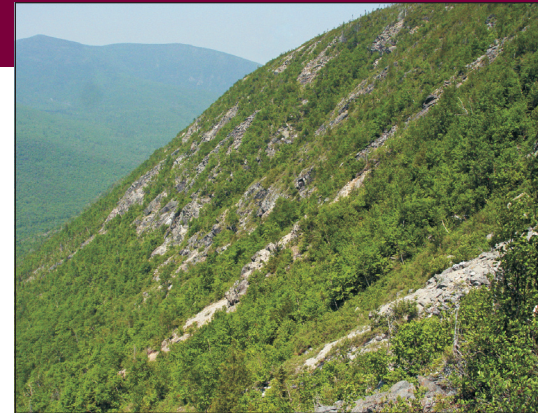
Acidic Cliff - Gorge

Common ravens, peregrine falcons, and golden eagles may nest on cliffs in western, northern and coastal Maine.